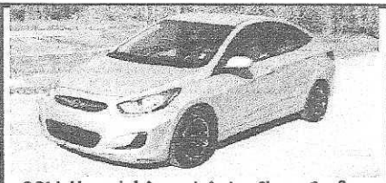
2014 Hyundai Accent Auto, Clean Carfax, PW, New Tires, Low Miles, PL, 38 MPG