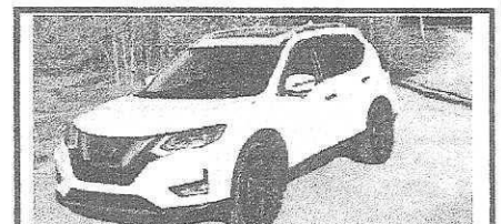
2017 Nissan Rogue Fully Loaded, Backup Camera, Leather, Heated Seats, Panoramic Sunroof, NAV, PW, PL