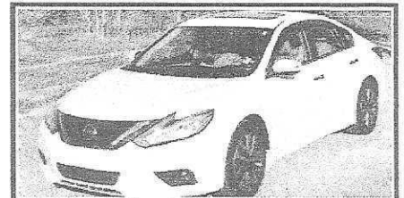
2014 Nissan Altima Leather, NAV, Sunroof, Heated Seats, PW, PL, Alloy Wheels, Extra Clean