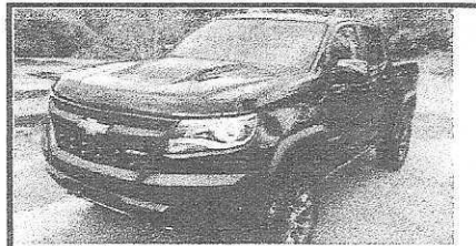
2017 Chevy Silverado 4x4. ZR2, Tow Pkg, Bed Liner, Locally Owned. Leather, Just 28k Miles