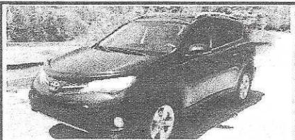
2014 Toyota RAV 4 Sunroof, Alloy Wheels, New Tires, A/C, PW, PL, Excellent Condition