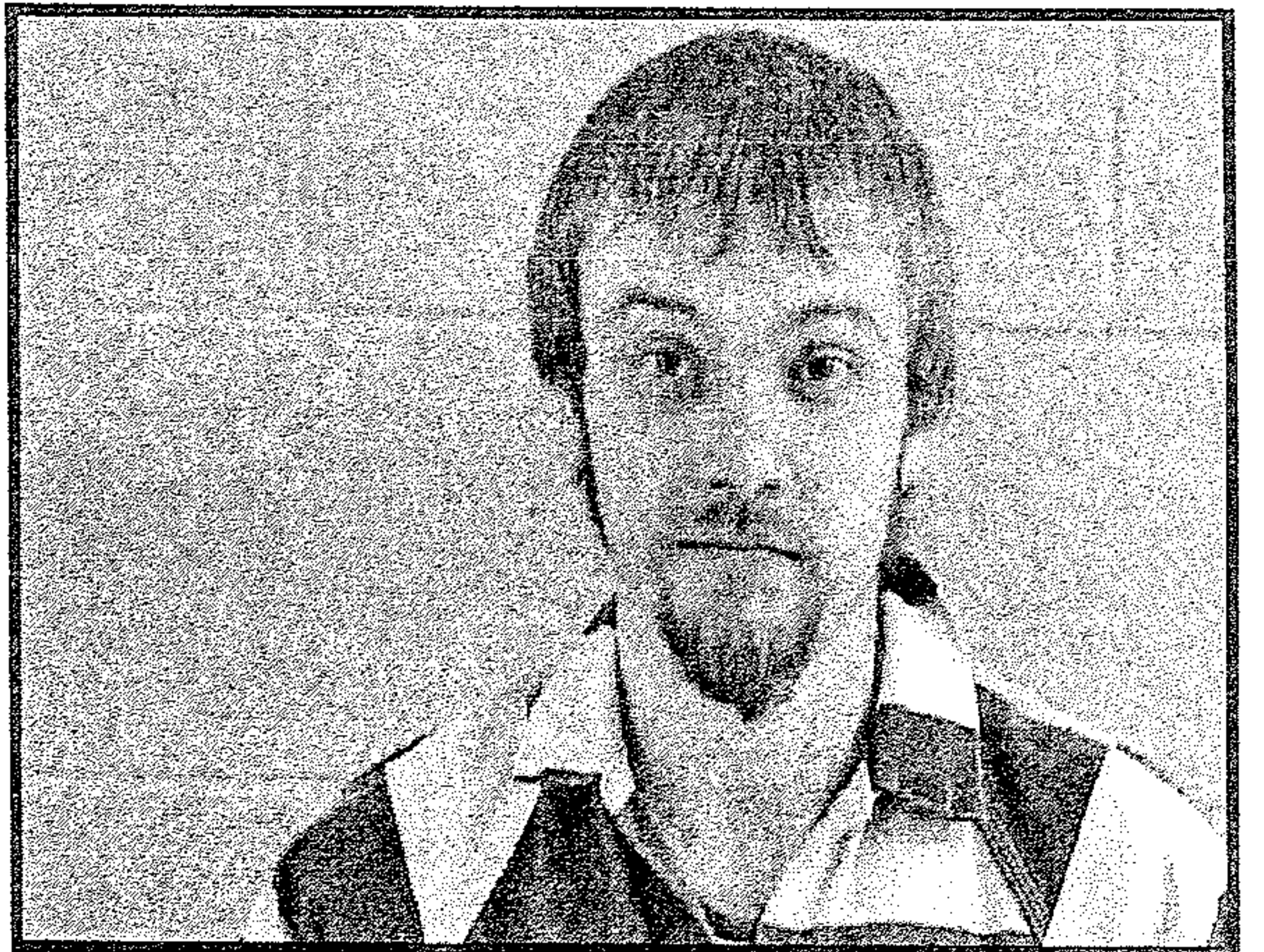
(see assault pg. 4)