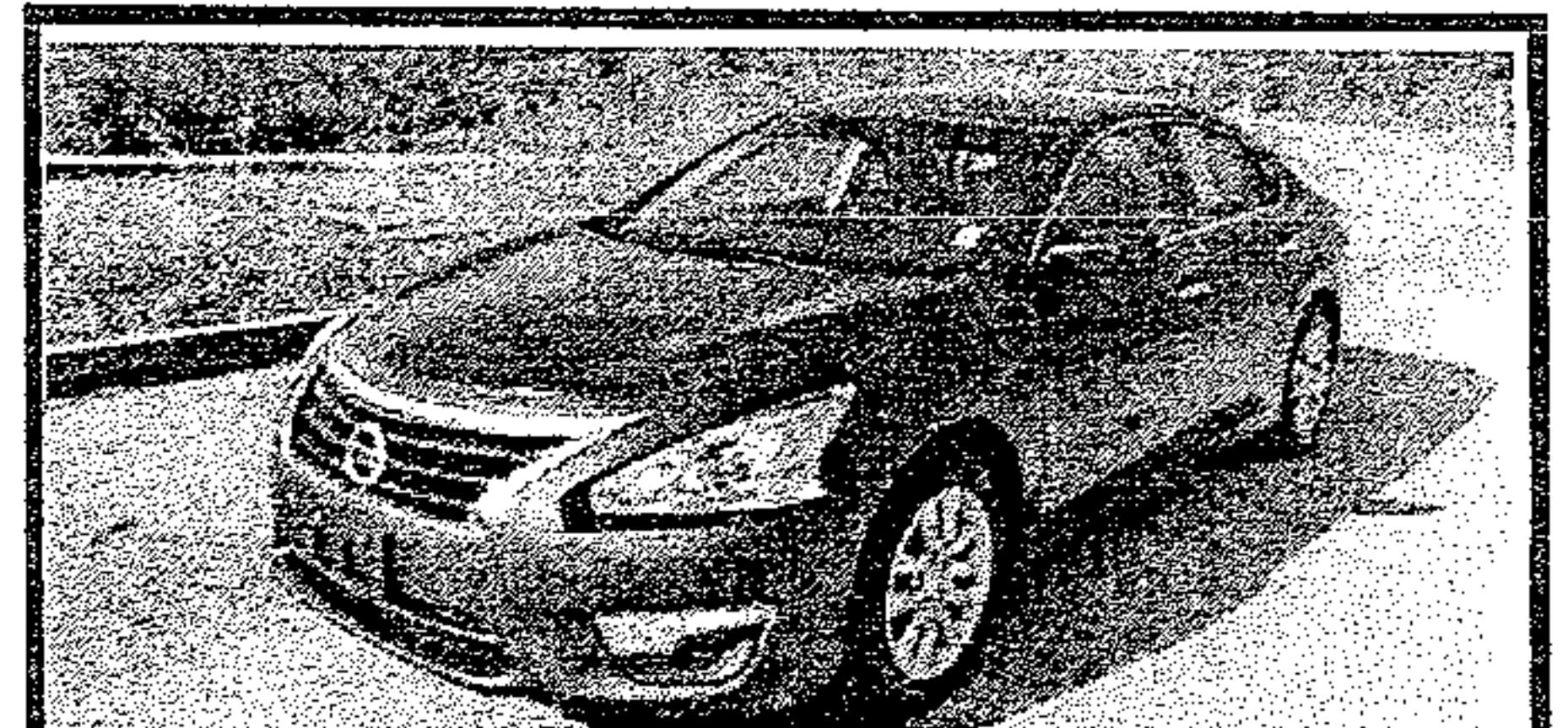
2013 Nissan Altima Remote Start, PW, PL, Auto, 2.5, Only 96k