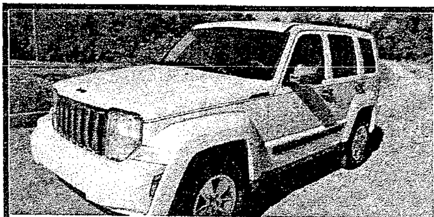
2009 Jeep Liberty Chrome pkg, 52k, PW, PL, V6, Tow pkg, Luggage Rack