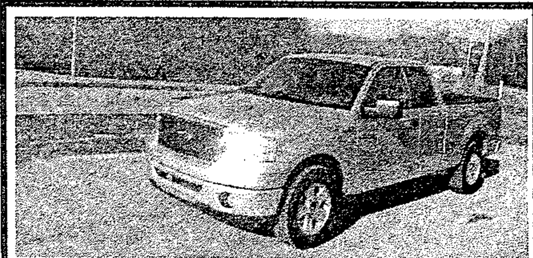
2008 Ford F150 93k, EXT Cab, V8, Auto, Tow PKG, Bed Liner, Like New, PW, PL, A/C