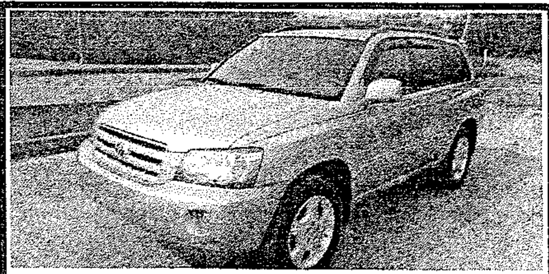
2005 Toyota Highlander 4x4, 99k, Leather, V6, Auto, PS, Sunroof, 3rd Row Seat,