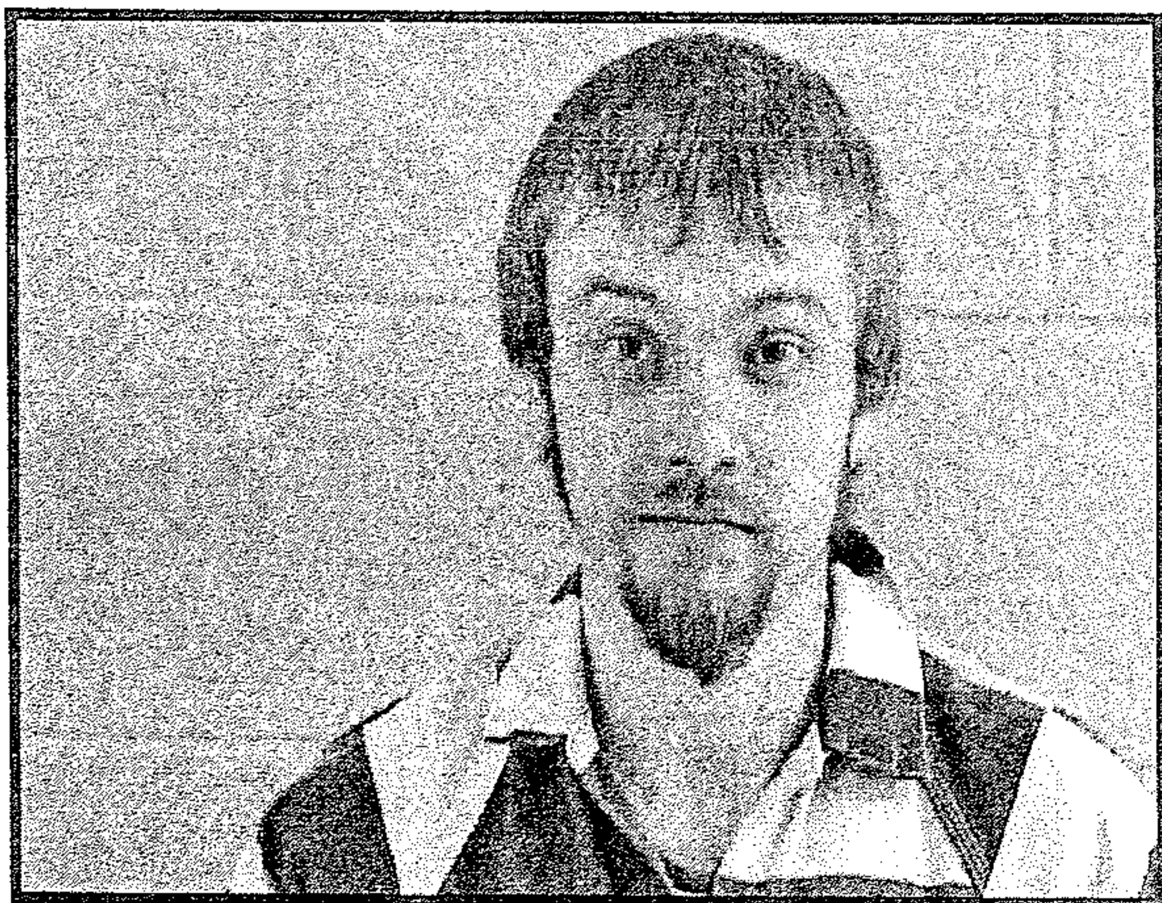
(see assault pg. 4)