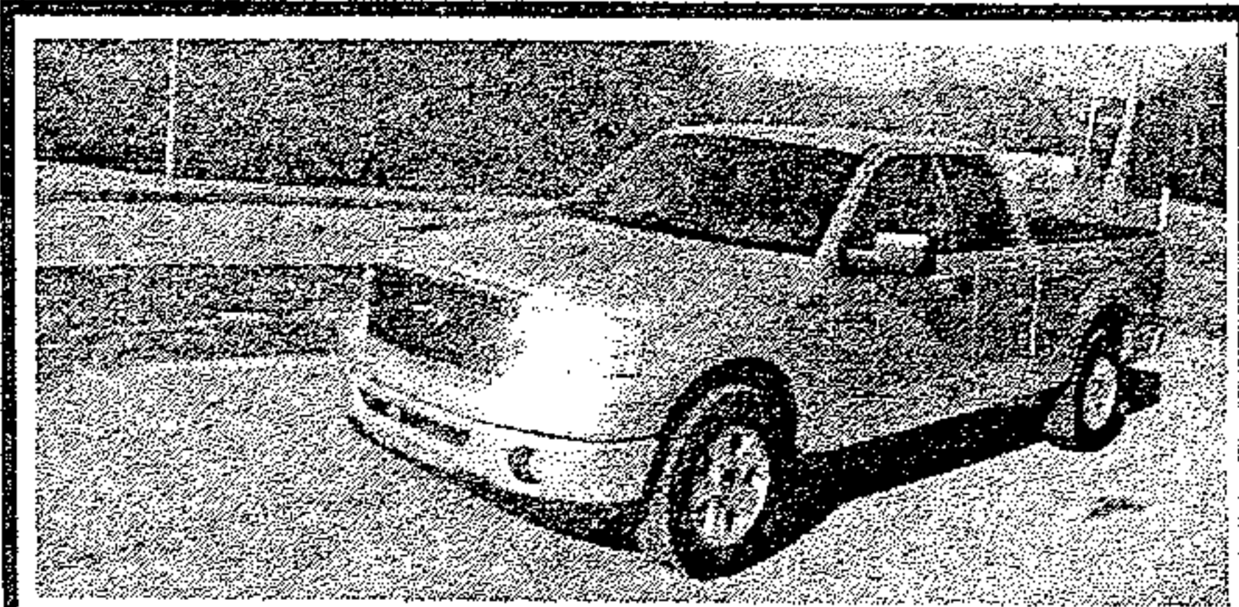
2008 Ford F150 93k, EXT Cab, V8, Auto, Tow PKG, Bed Liner, Like New, PW, PL, A/C