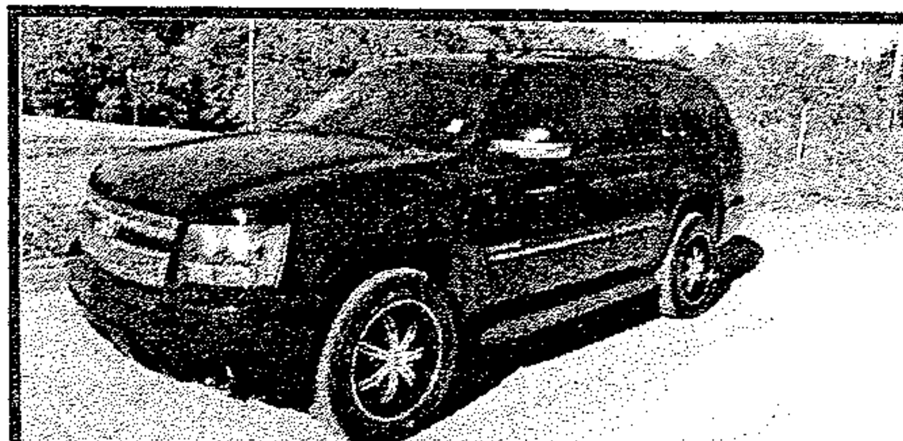
2007 Chevy Tahoe NAV, Leather, PW, PL, PS, Tow pkg, Pwr 2nd Row, 3rd Row