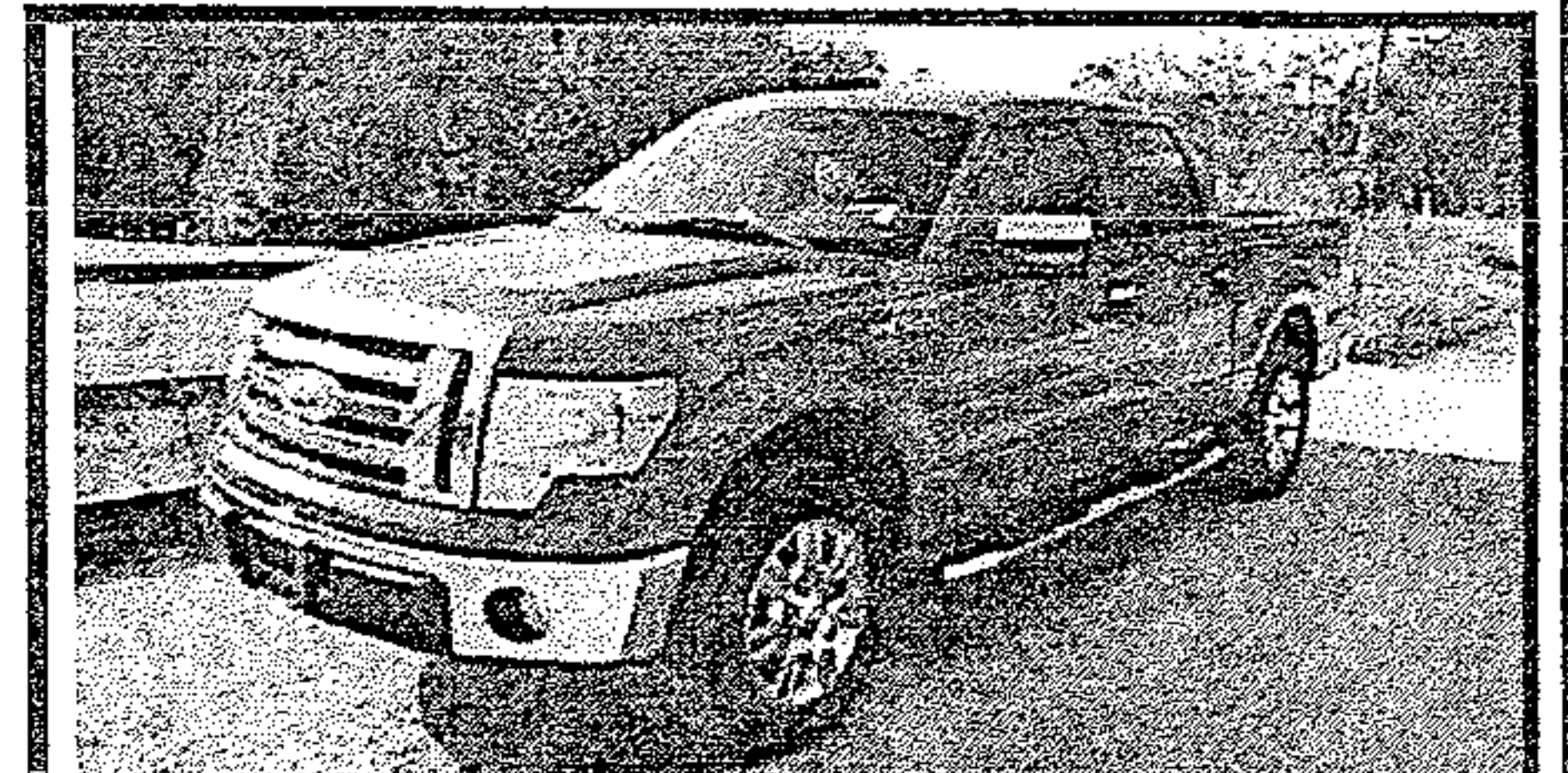
2009 Ford F150 Crew Cab, XLT, V8, Auto, Tow Pkg, Bed Liner, AC, PW, PL, Alloy Wheels