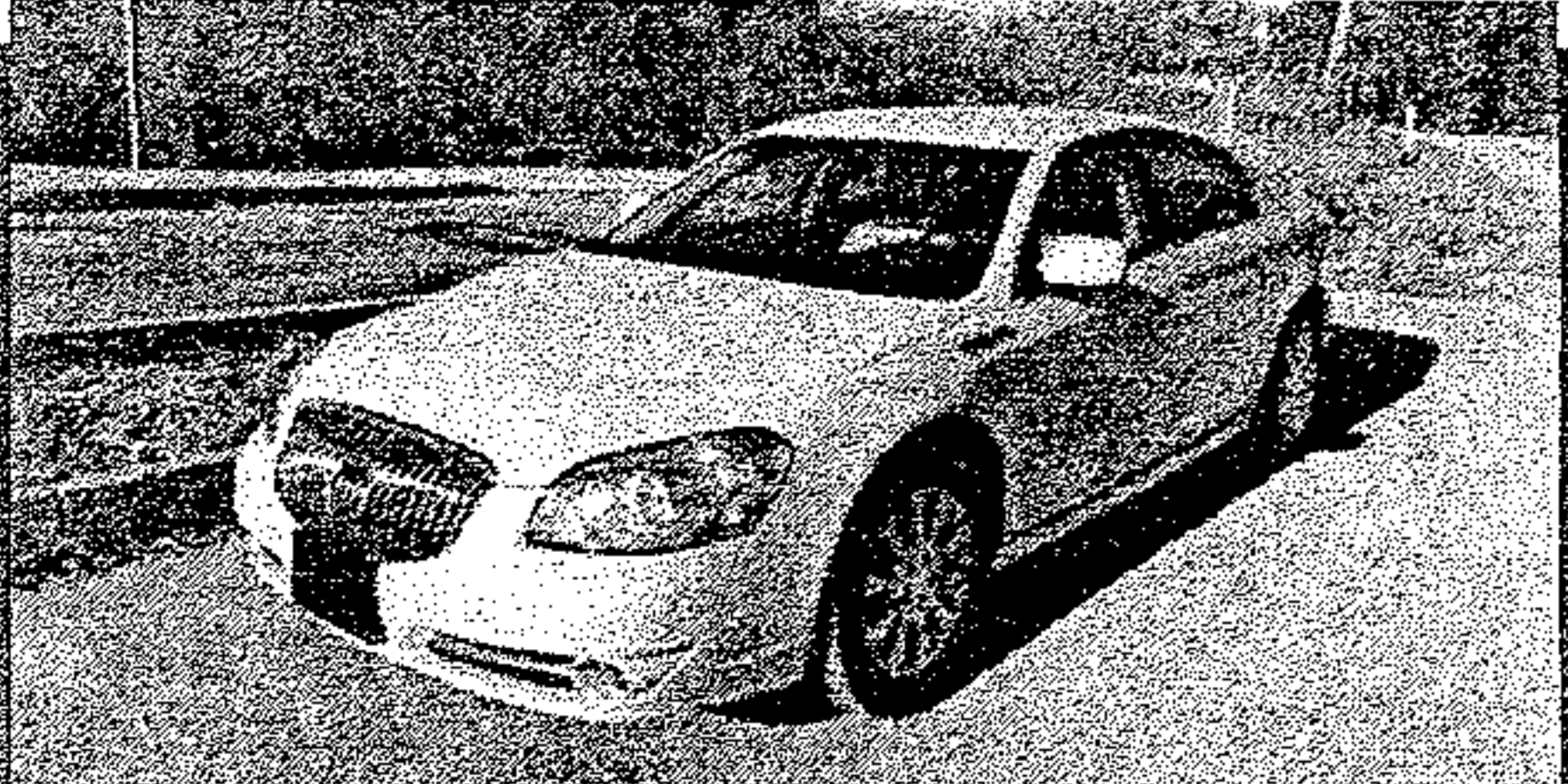
2011 Buick Lucerne, Immaculate condition, Like new, Only 69k, Alloy Wheels, PS, PW, PL, 27 MPG!