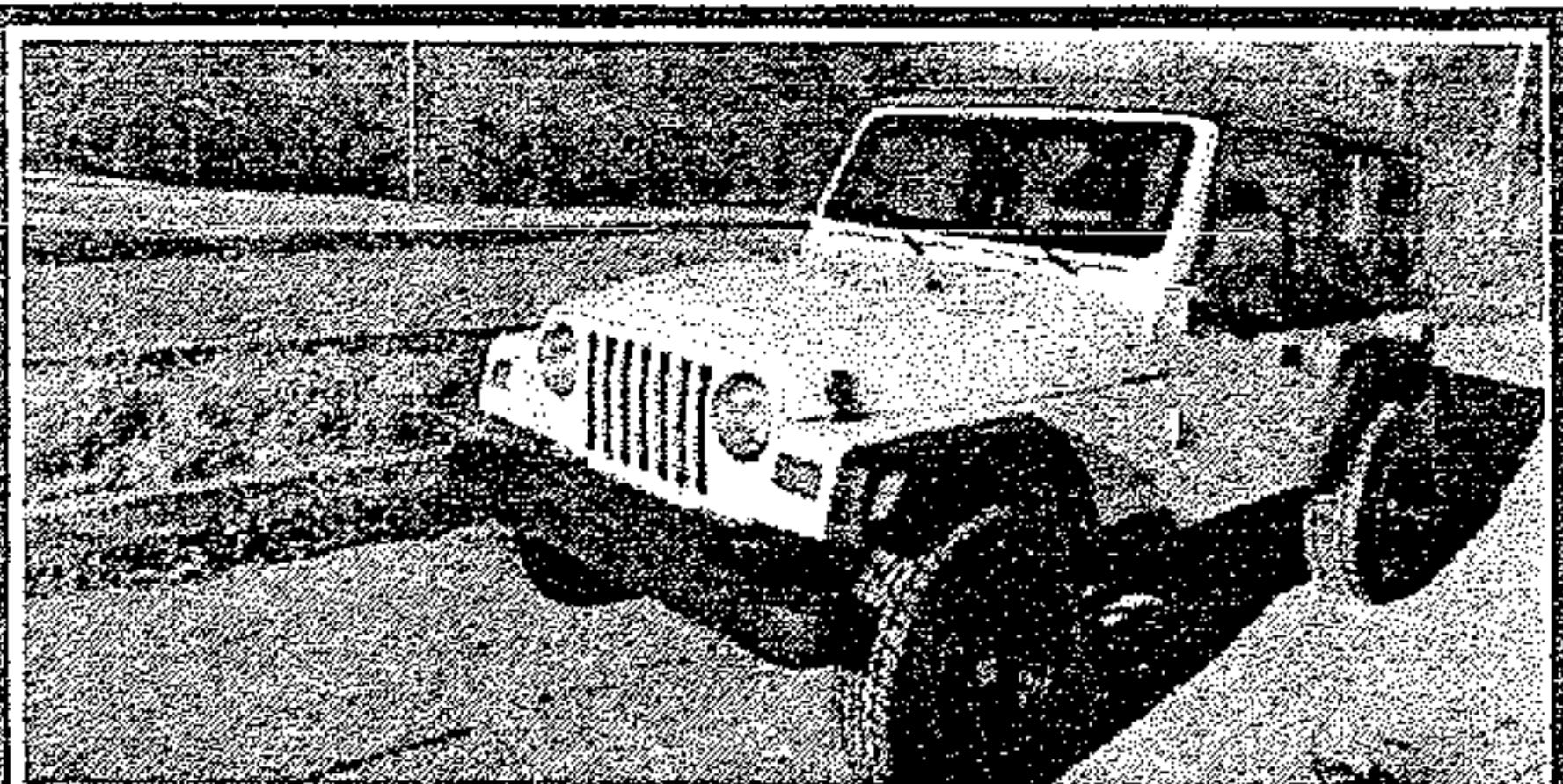
1997 Jeep Wrangler, 4x4, Auto, low Miles, One Owner, A/C, Heat, Top is like new,