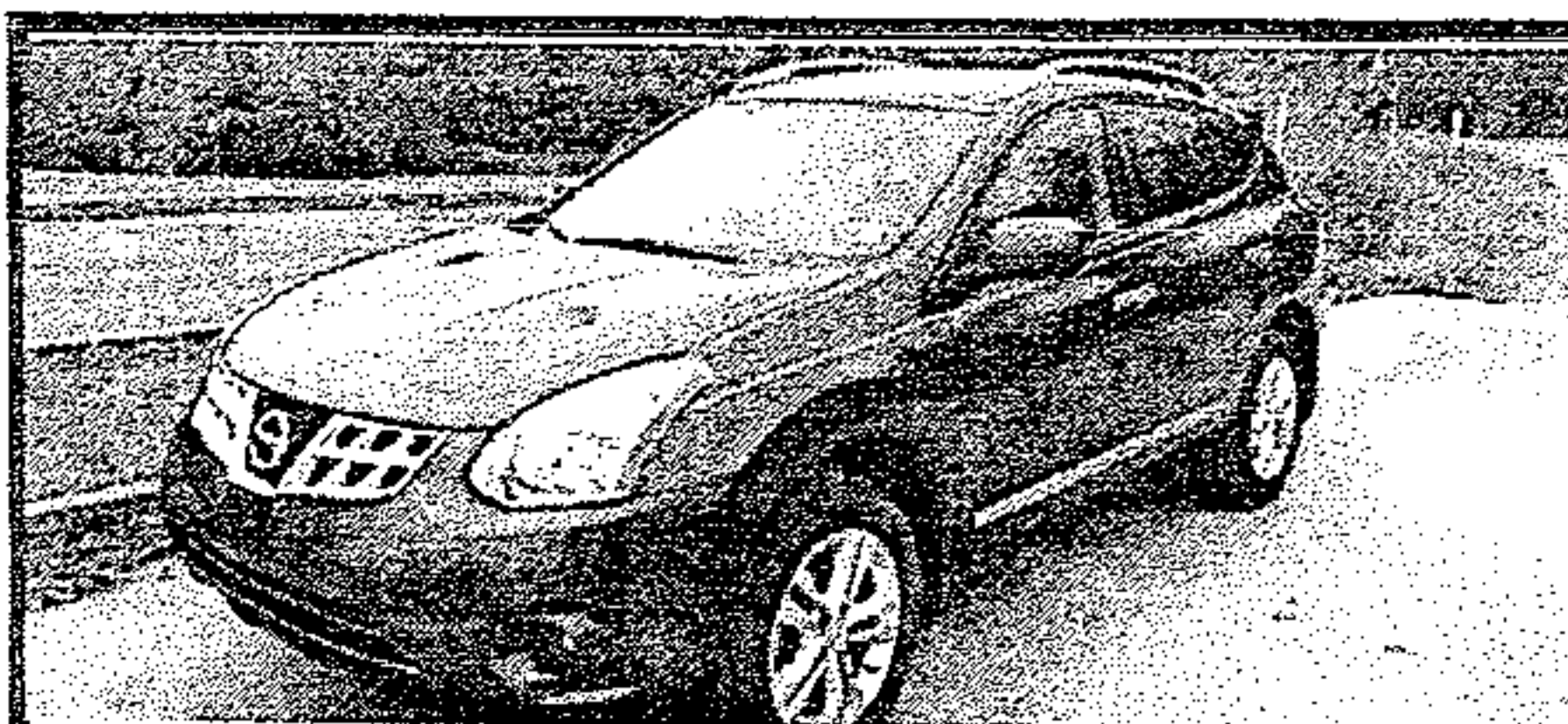
2013 Nissan Rogue AWD, PW, PL, PS, Sunroof, Alloy Wheels, V6, Luggage Rack