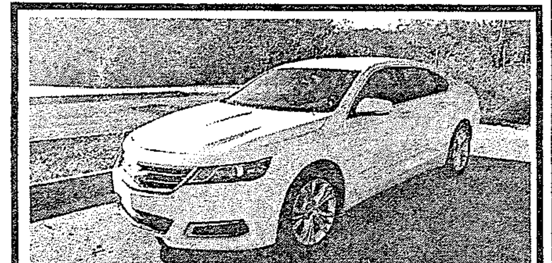
2015 Chevy Cruze, 52k Miles, Gas Saver, 42 MPG, PW, PL, Local Car, Auto, 4 Cylinder, LT