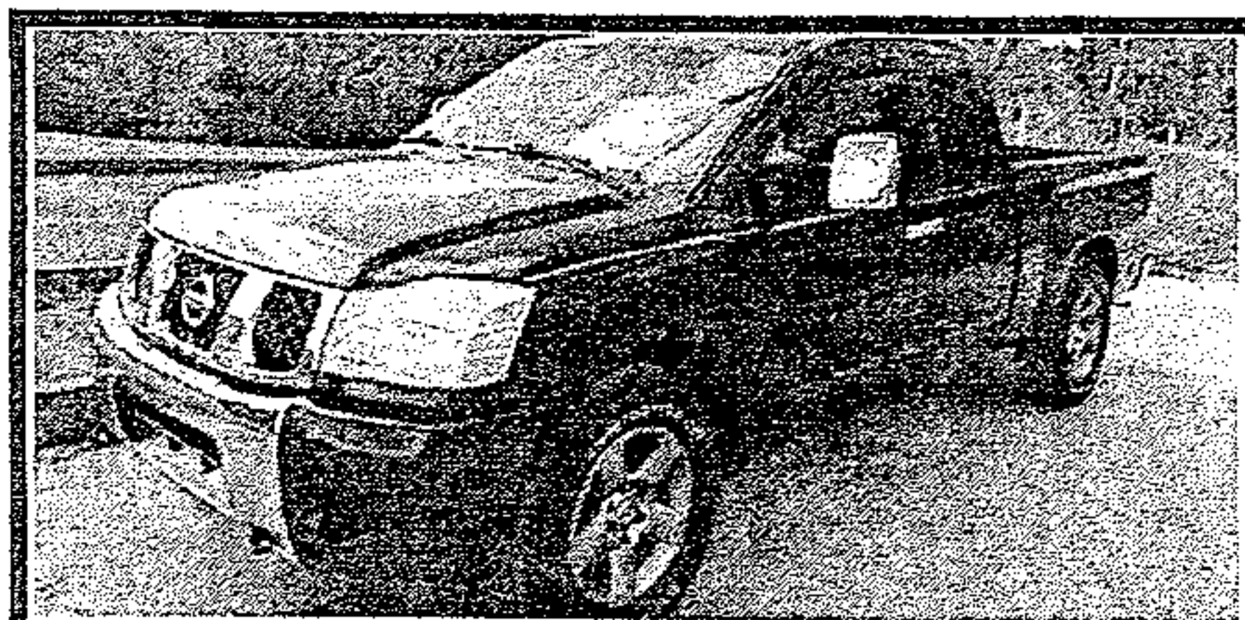
2005 Nissan Titan Ext Cab, V8, Auto, Like New, Low Miles, AC, PW, PL, Tow PKG, Bed Liner