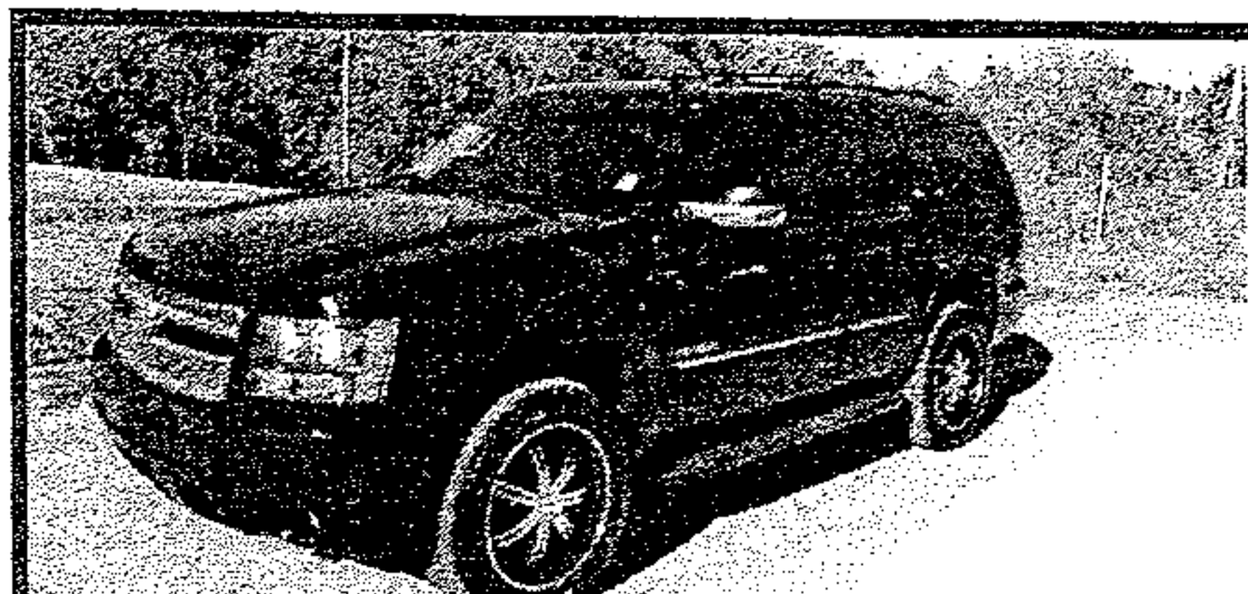
2007 Chevy Tahoe NAV, Leather, PW, PL, PS, Tow pkg, Pwr 2nd Row, 3rd Row