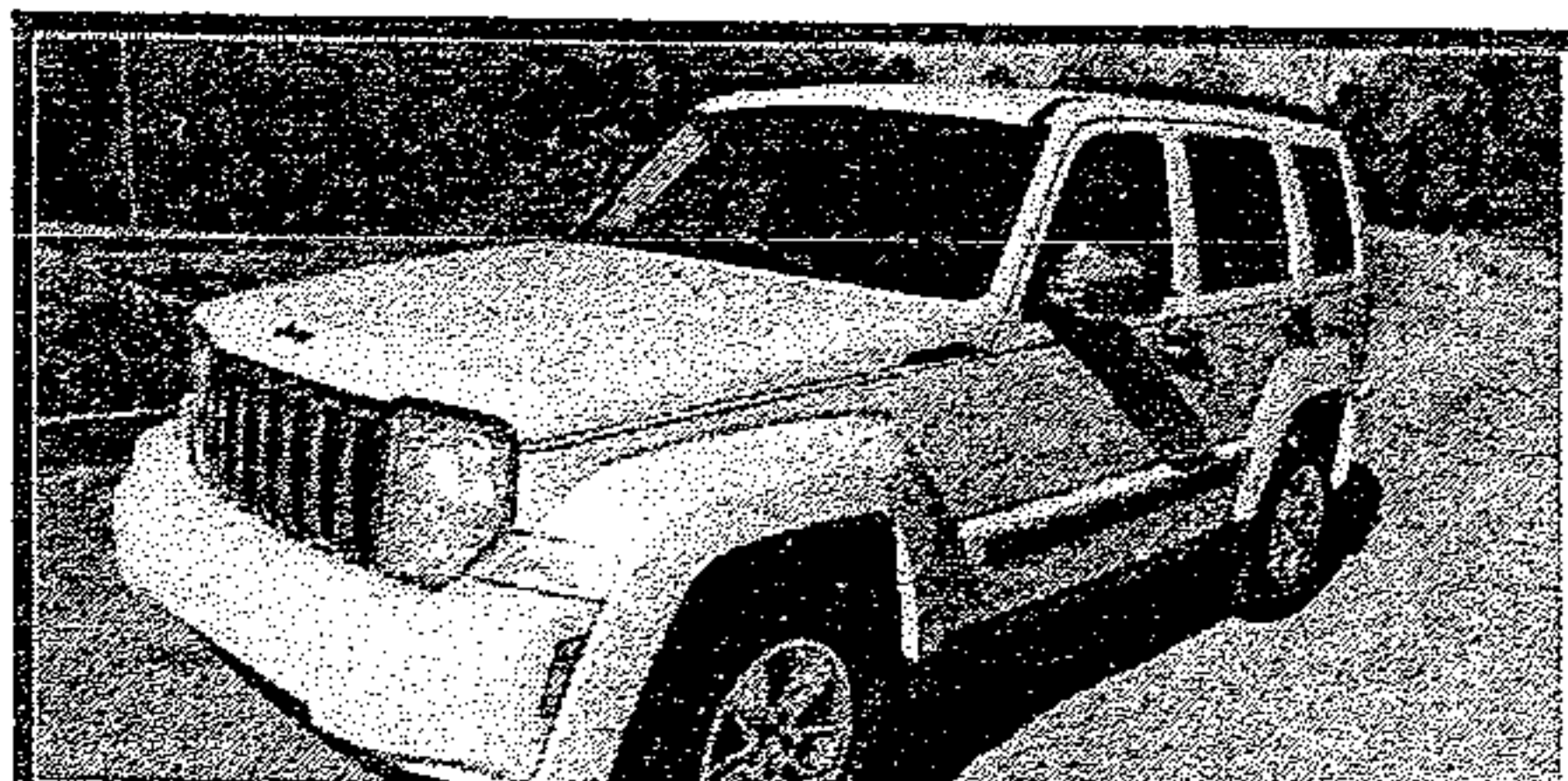
2009 Jeep Liberty Chrome pkg, 52k, PW, PL, V6, Tow pkg, Luggage Rack