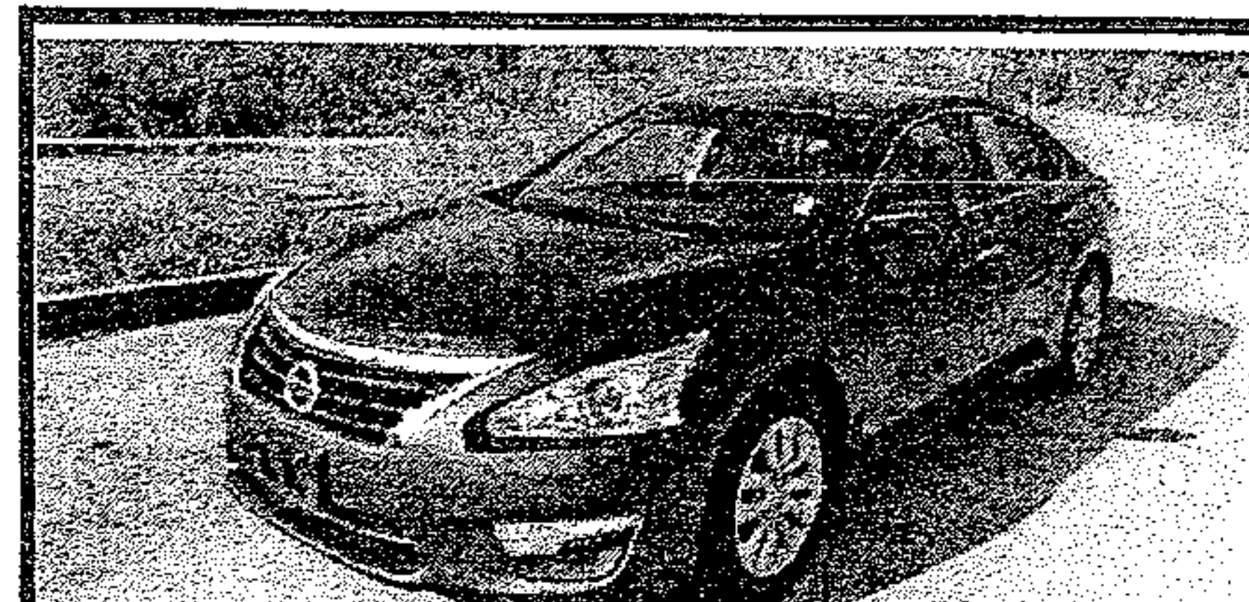
2013 Nissan Altima Remote Start, PW, PL, Auto, 2.5, Only 96k