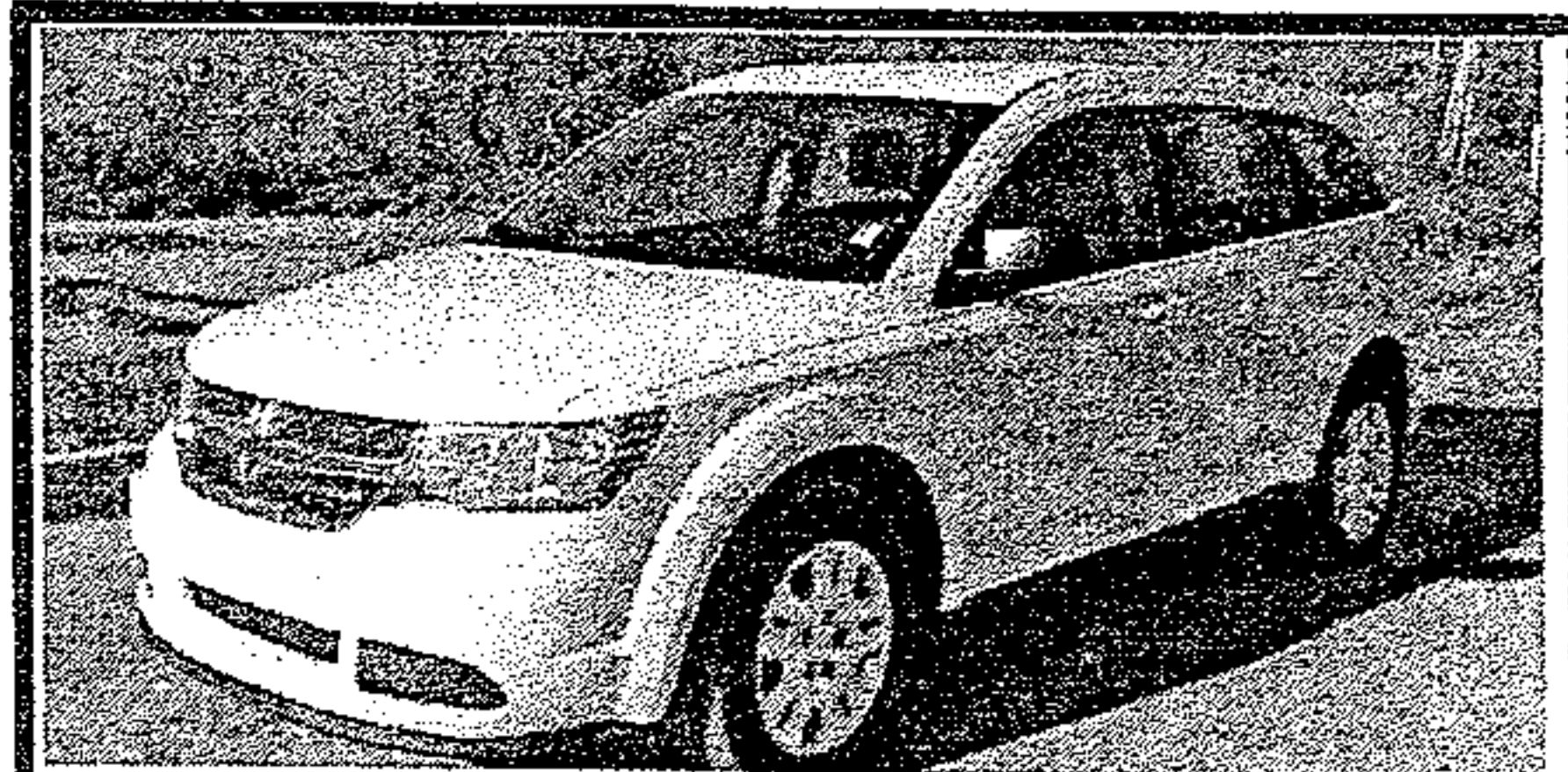
2014 Dodge Journey 33k, 3rd Row Seat, V6, Auto, A/C, Heat, Alloy Wheels