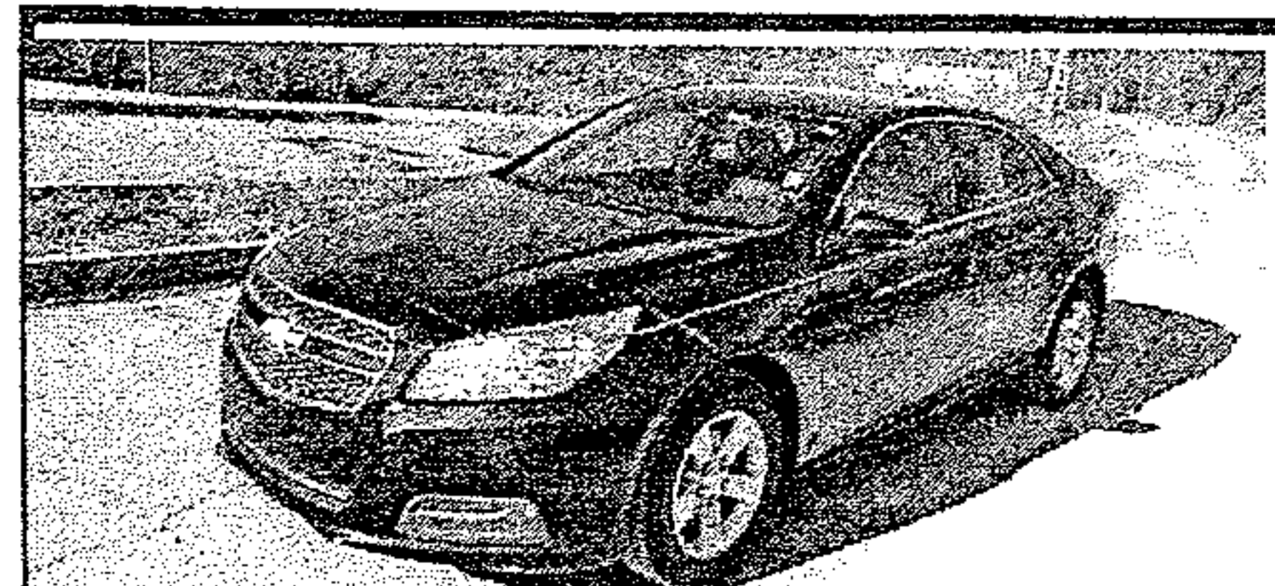
2013 Chevy Malibu Alloy Wheels, Low Miles, Leather, Cruise, PW, PL, 37 MPG!