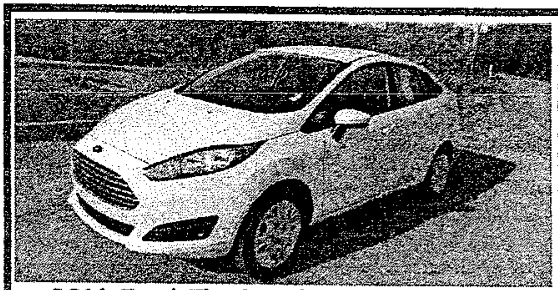
2016 Ford Fiesta 11k, 5spd, PL, One Owner, PM, A/C, Heat, Like New