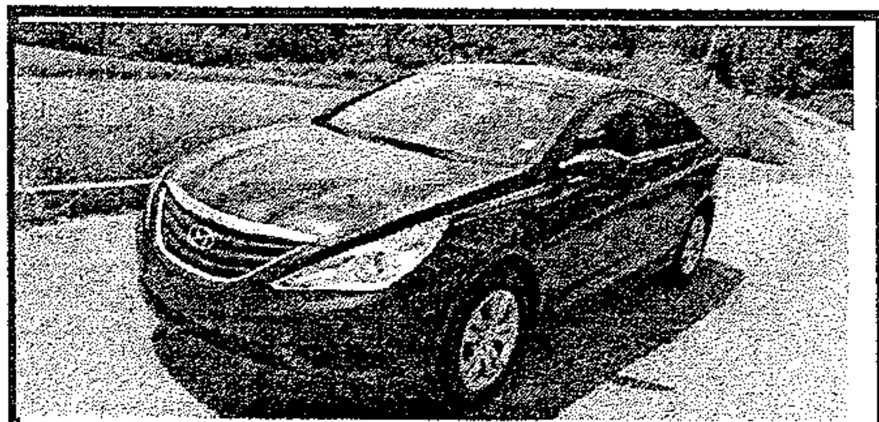
2012 Hyundai Sonata Cruise, PW, PL, A/C, Alloy Wheels, Keyless Entry, AUX/USB Hook-up