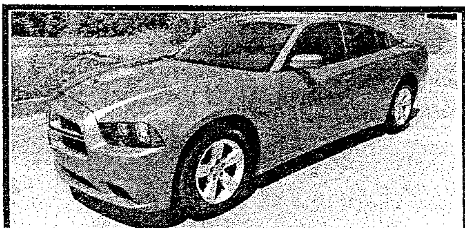
2011 Dodge Charger, Low Miles, Alloy Wheels, A/C, PW, PL, PS, Touch Radio