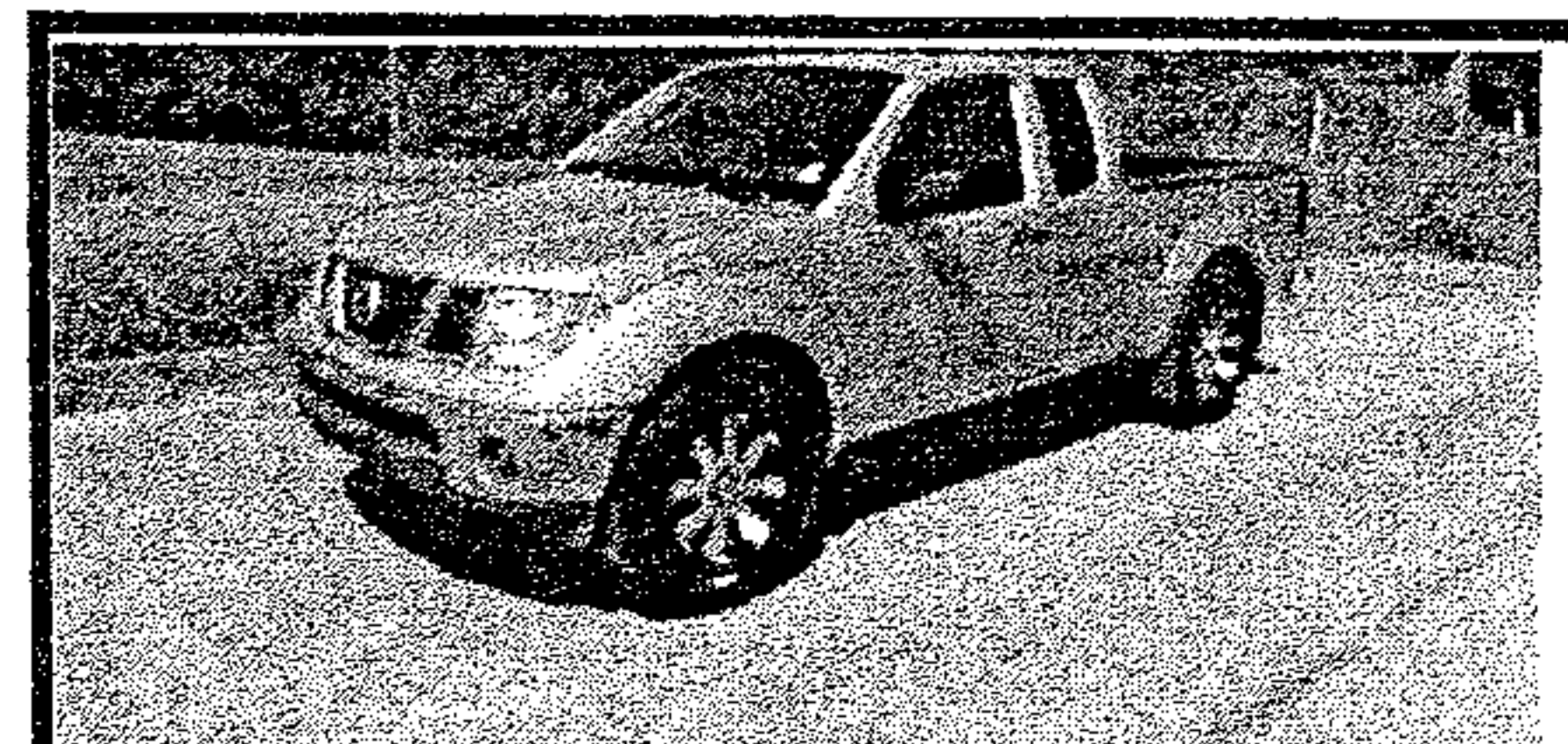
2007 Nissan Frontier King Cab, V6 Power, Bed Liner, Immaculate Condition, Auto