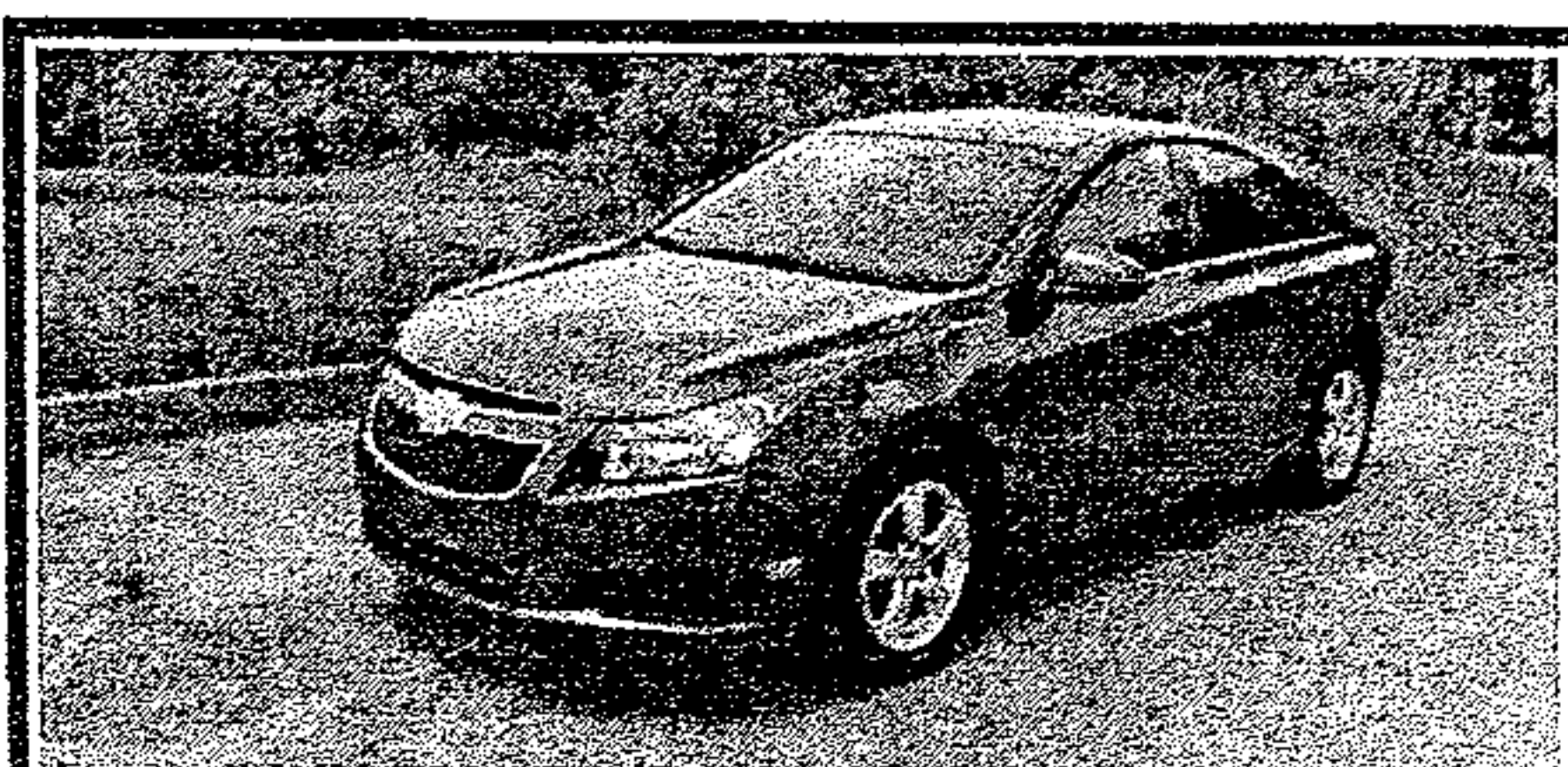
2012 Chevy Cruze, Gas Saver, 40 MPG, Like New, Cold Air, PW, PL, Alloy Wheels