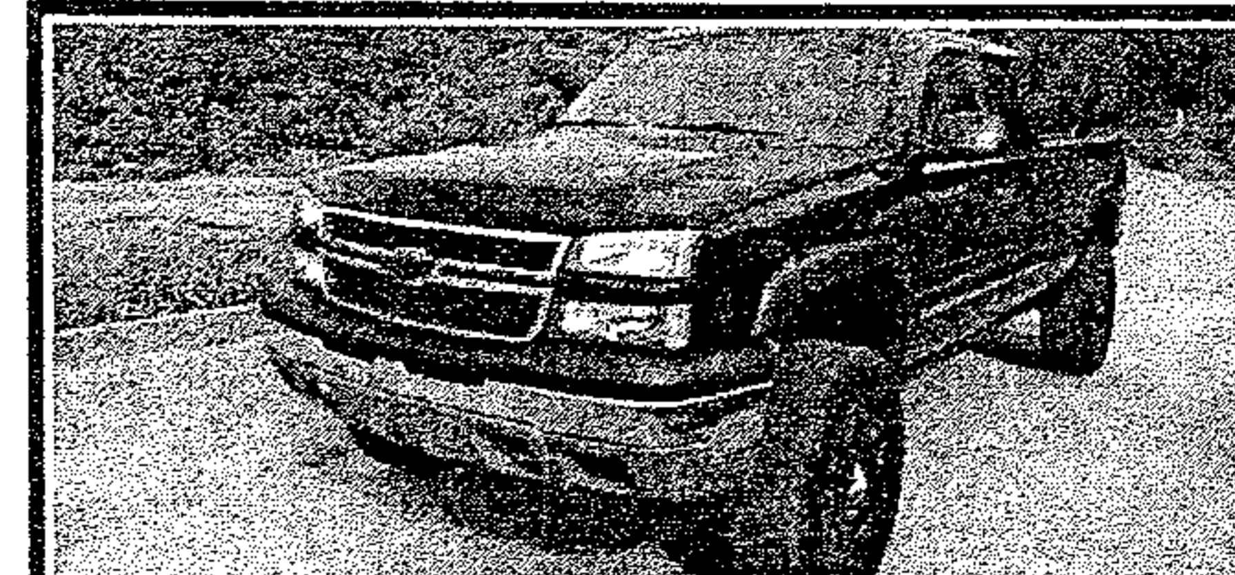
2008 Hyundai Tucson, Loaded, Leather, Sunroof, V6, Auto, PS, PW, PL

DEPENDABLE MOTORS 986-9343 803 E. Broadway • Lenoir City