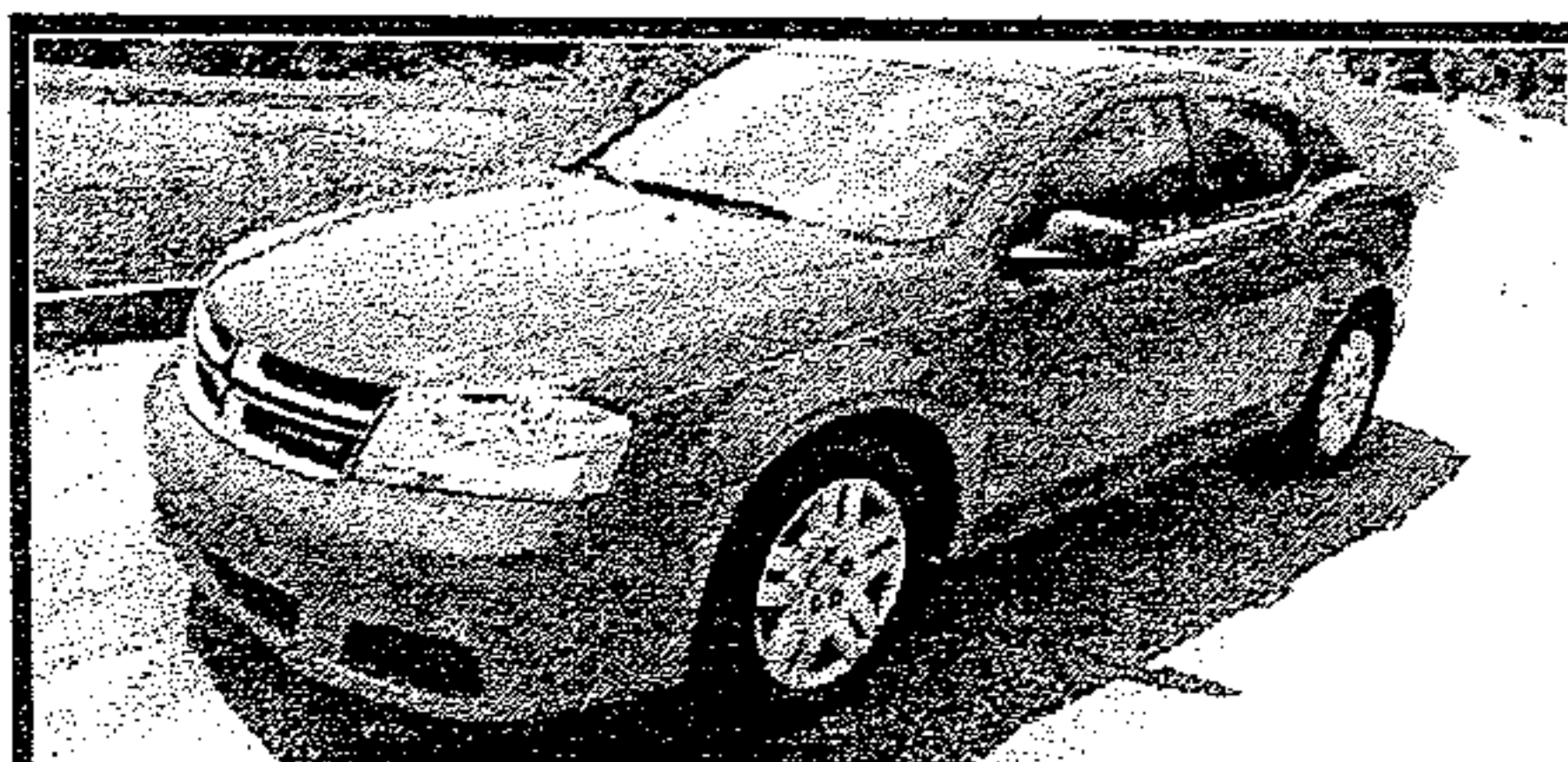
2014 Dodge Avenger Super Low Miles, Alloy Wheels, 2.4 L, PW, PL, A/C, Auto