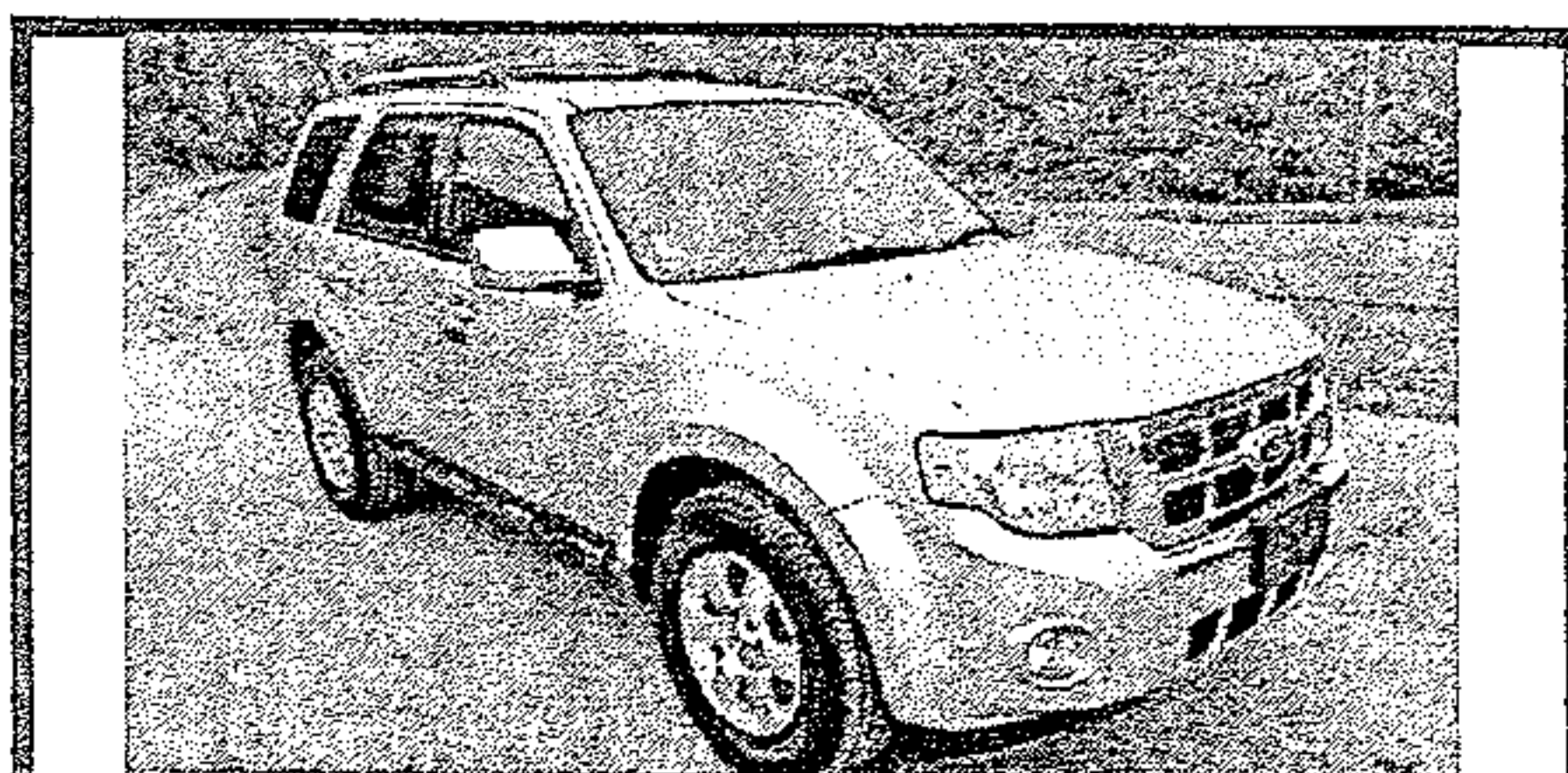
2010 Ford Escape Limited Leather, Alloy Wheels, Heat, A/C, Luggage Rack, 79K,