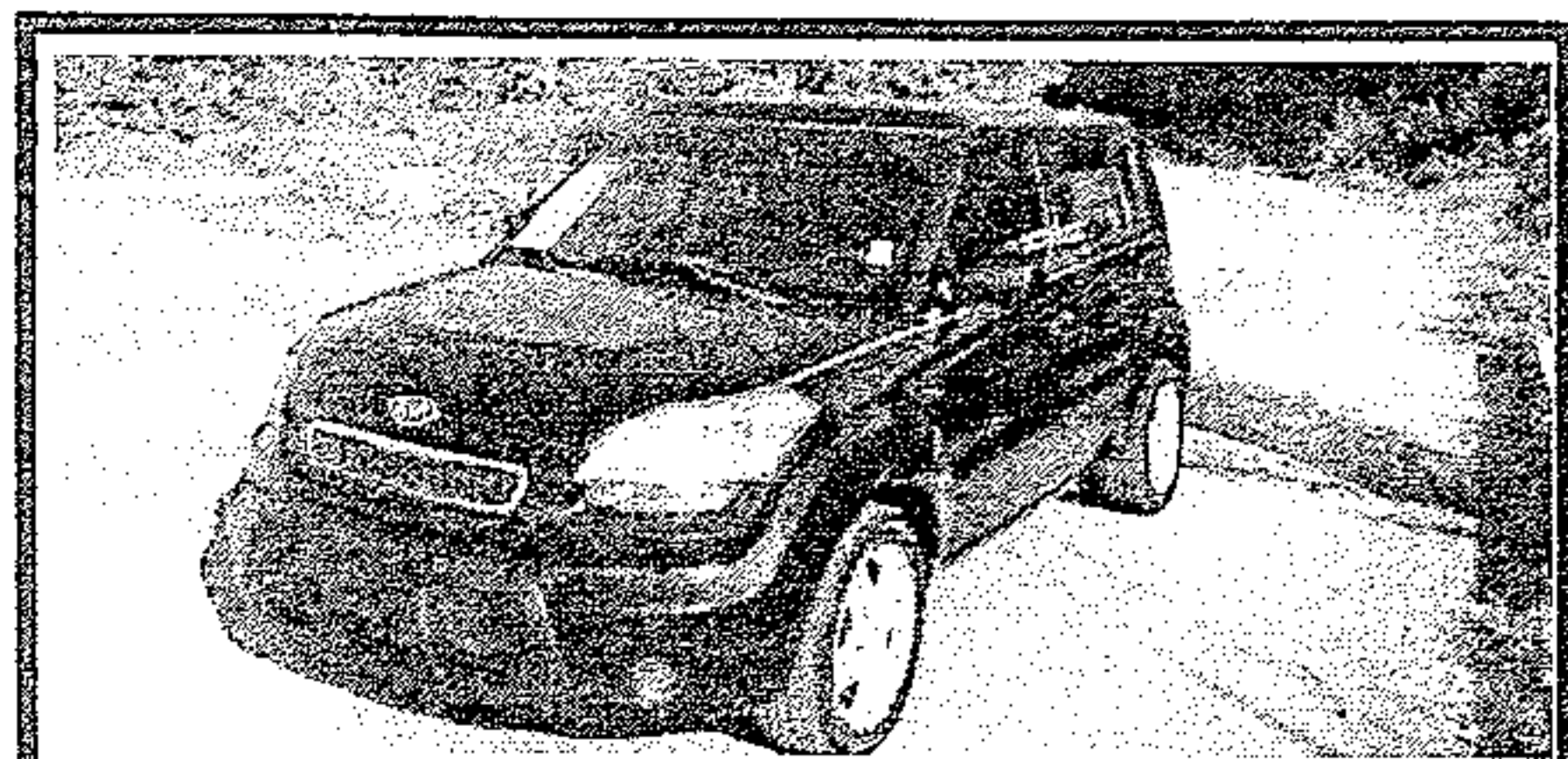
2010 Kia Soul Sporty, 4 cyl, Auto, PW, PL, A/C, Great On Gas, Like New