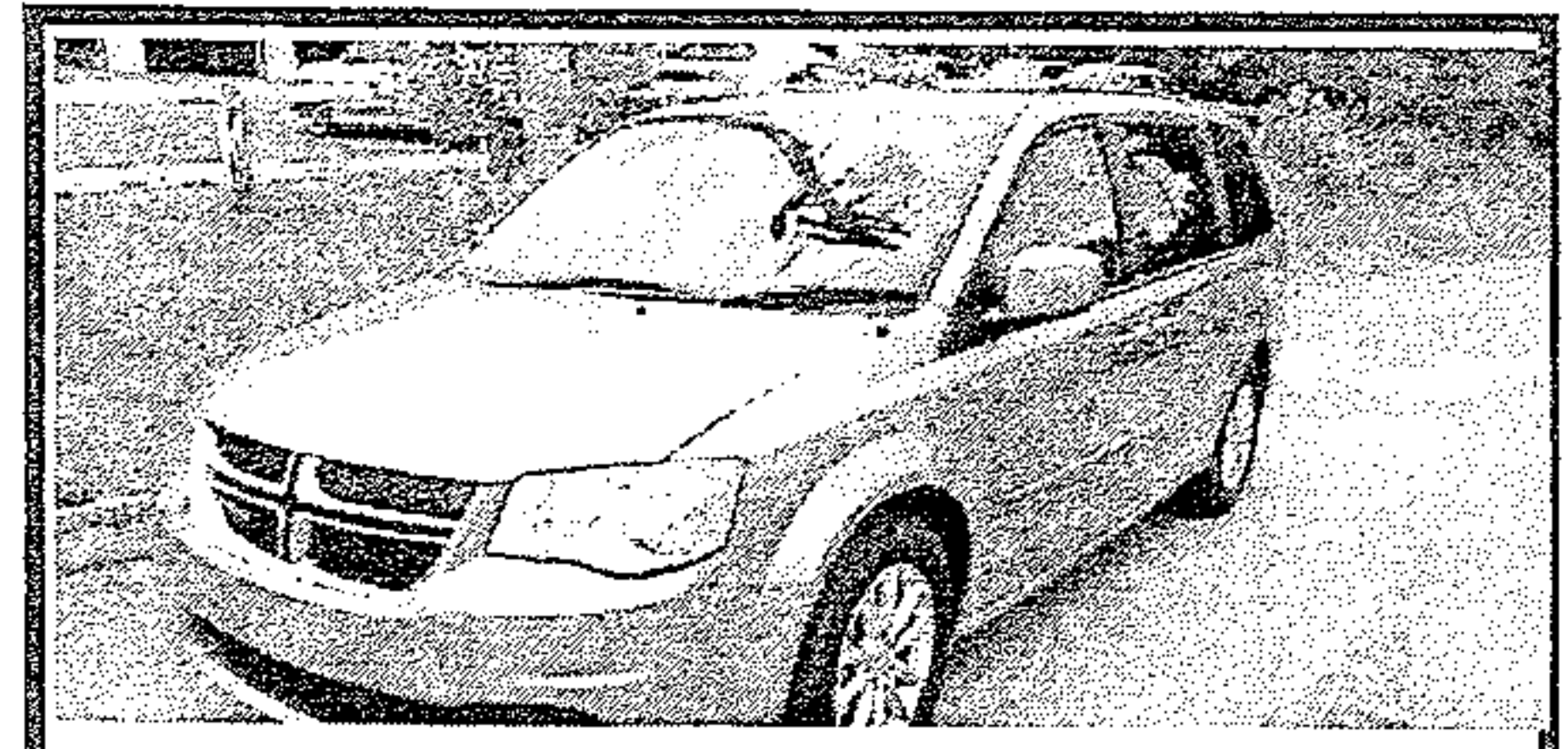
2011 Dodge Grand Caravan DVD, Stow & Go, Loaded, Remote Doors, Rear A/C

DEPENDABLE MOTORS 986-9343 803 E. Broadway • Lenoir City