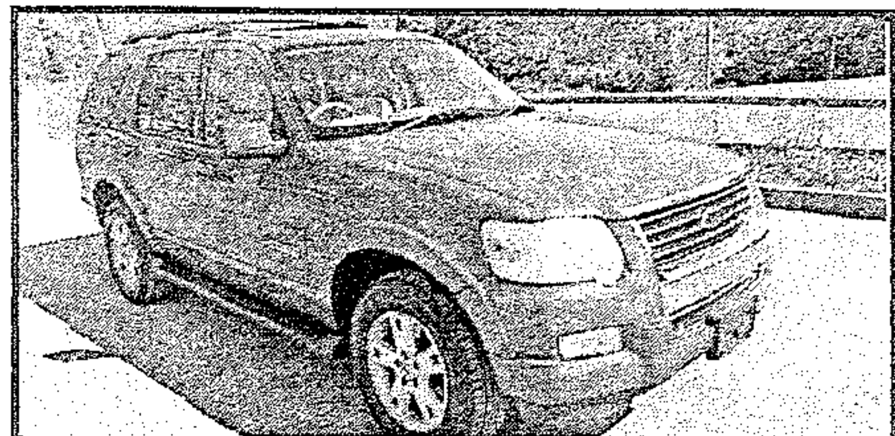
2008 Ford Explorer 84k, 3rd Row Seating, Luggage Rack, Tow Pkg, PW, PL