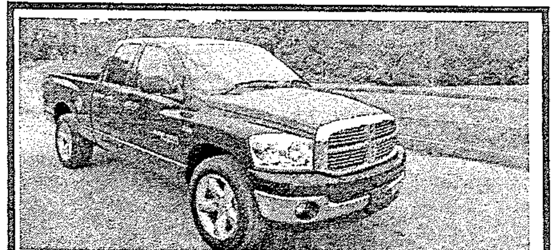
2007 Dodge Ram 1500 Quad Cab, Thunder Road PKG, 20 in. Wheels, Low Miles, Hemi