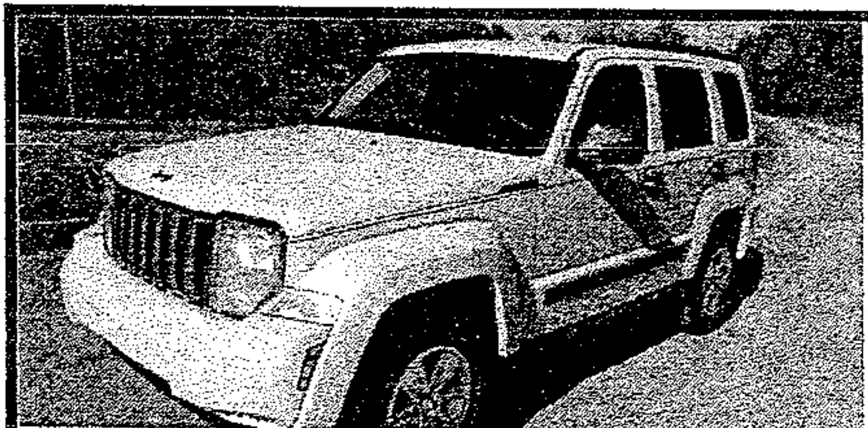
2009 Jeep Liberty Chrome pkg, 52k, PW, PL, V6, Tow pkg, Luggage Rack