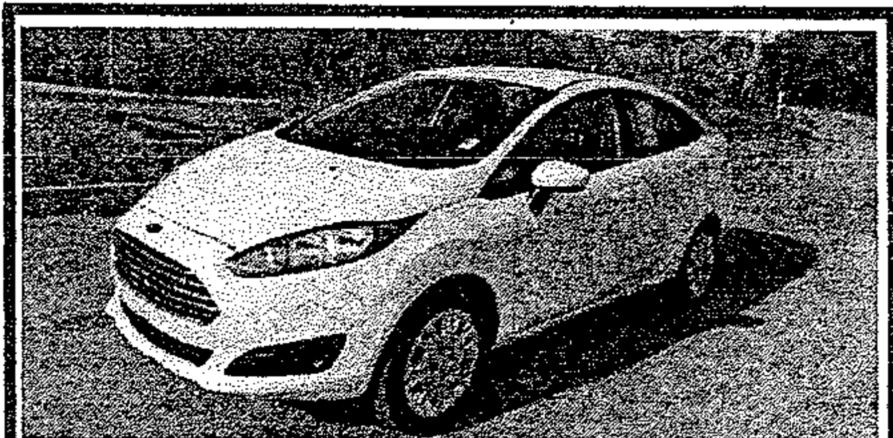
2016 Ford Fiesta 11k, 5spd, PL, One Owner, PM, A/C, Heat, Like New