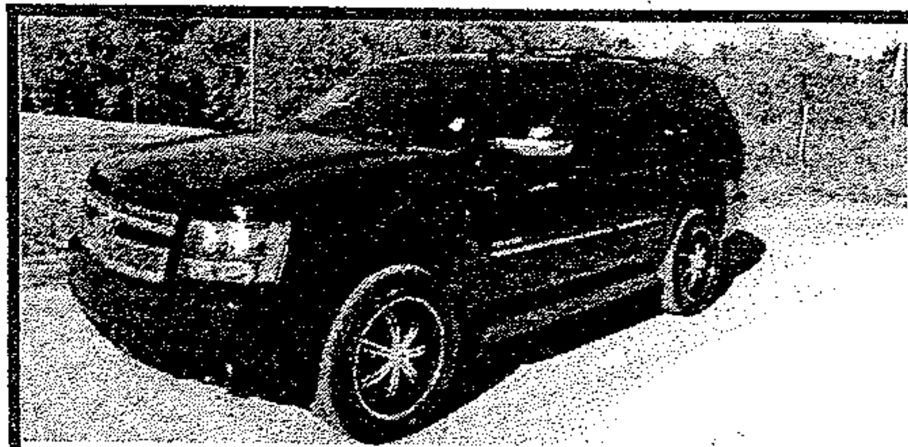
2007 Chevy Tahoe NAV, Leather, PW, PL, PS, Tow pkg, Pwr 2nd Row, 3rd Row