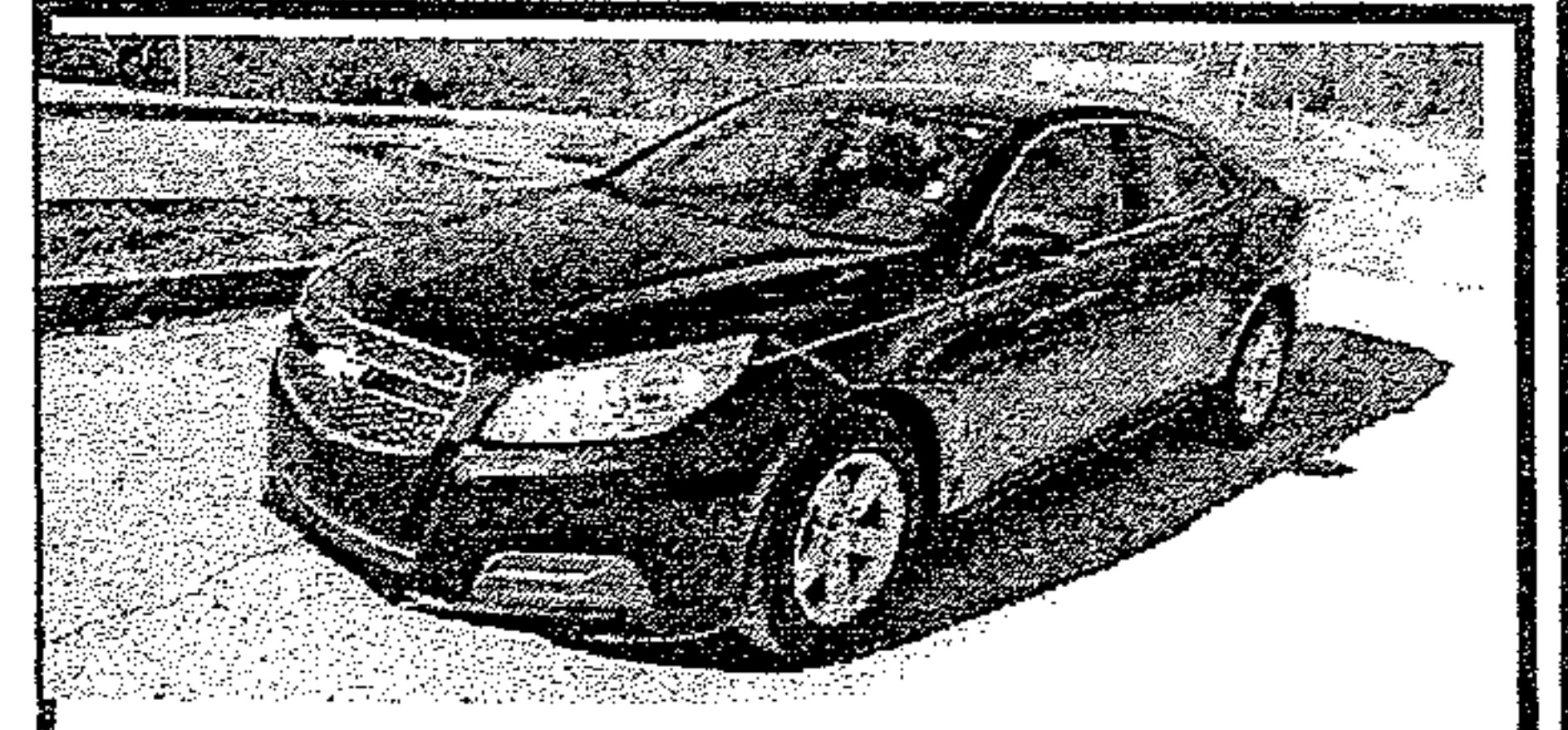
2013 Chevy Malibu Alloy Wheels, Low Miles, Leather, Cruise, PW, PL, 37 MPG!