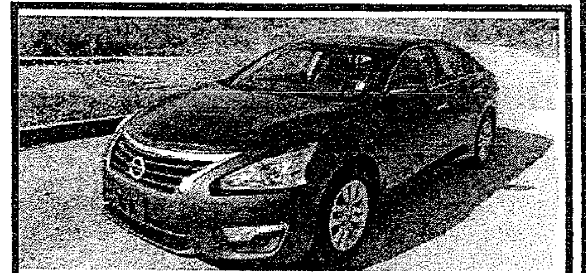
2013 Nissan Altima Remote Start, PW, PL, Auto, 2.5, Only 96k