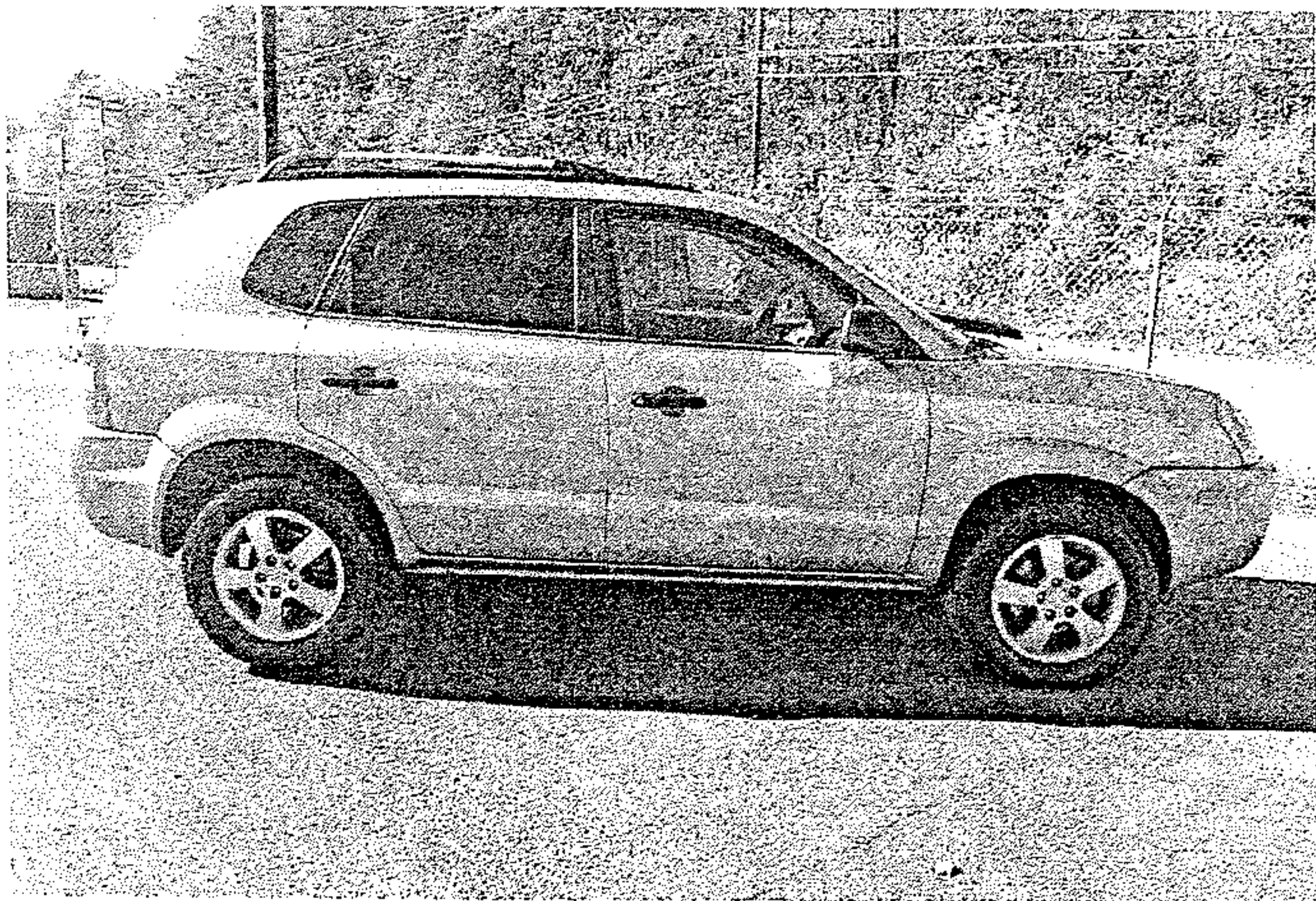
2008 Tucson, Super Nice SUV, Ready for a Road Trip with the Family!

Over 100 Cars, Trucks & Vans in Stock - Warranties on ALL Vehicles Sold!!!