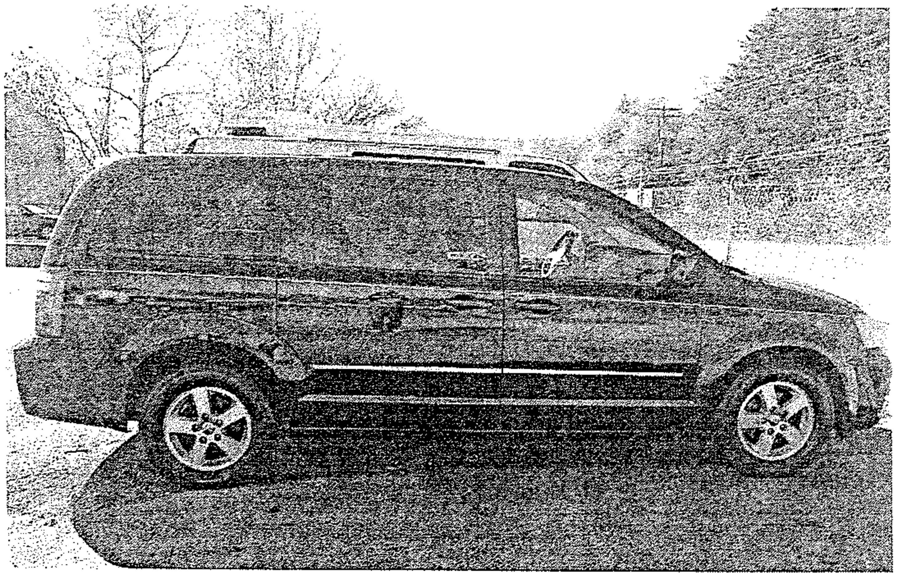
2008 Caravan, Lots of Room for Everyone, LOADED, LOADED, LOADED!!!