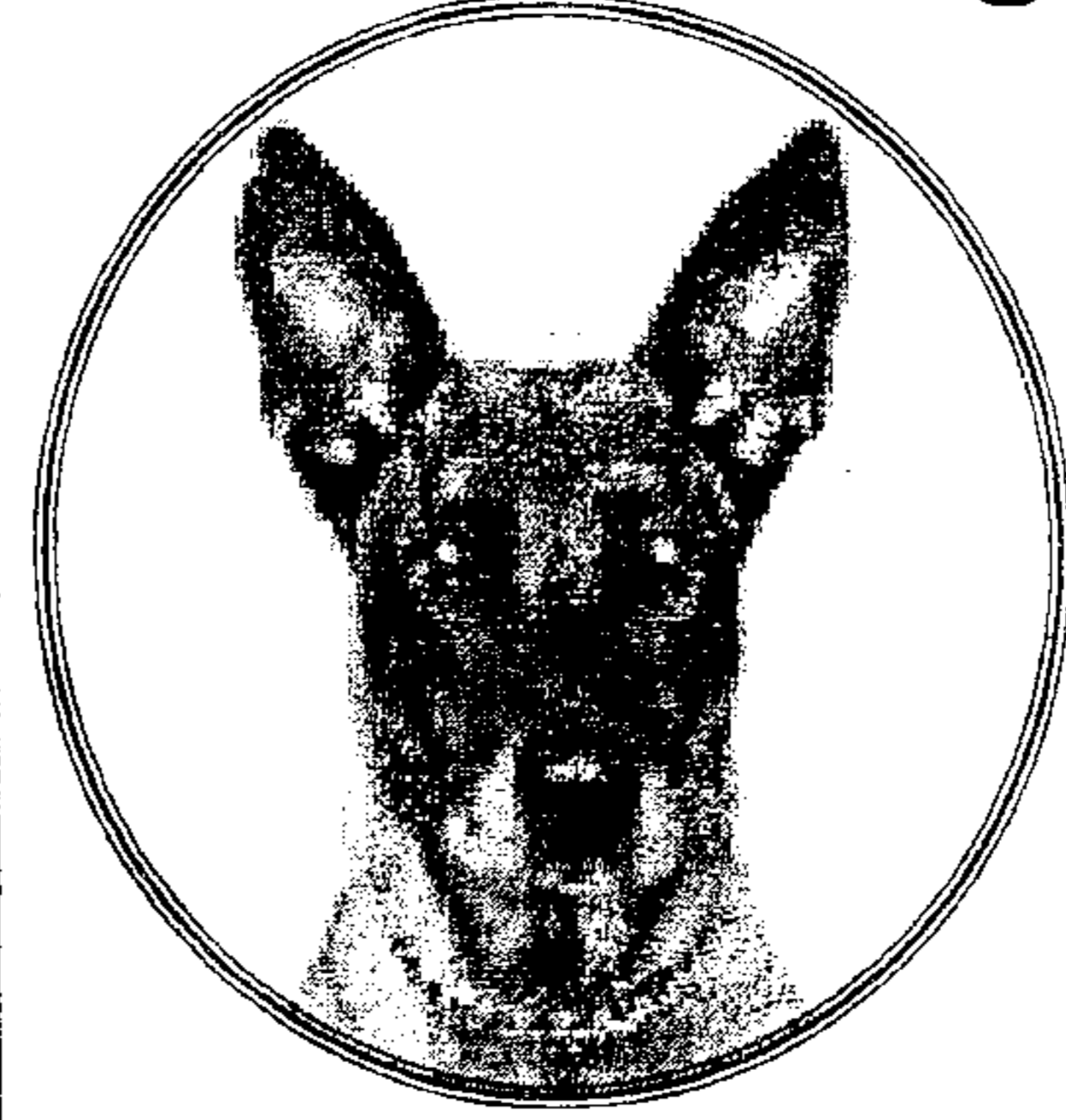
K9 Deacon E.O.W. 08/27/2012