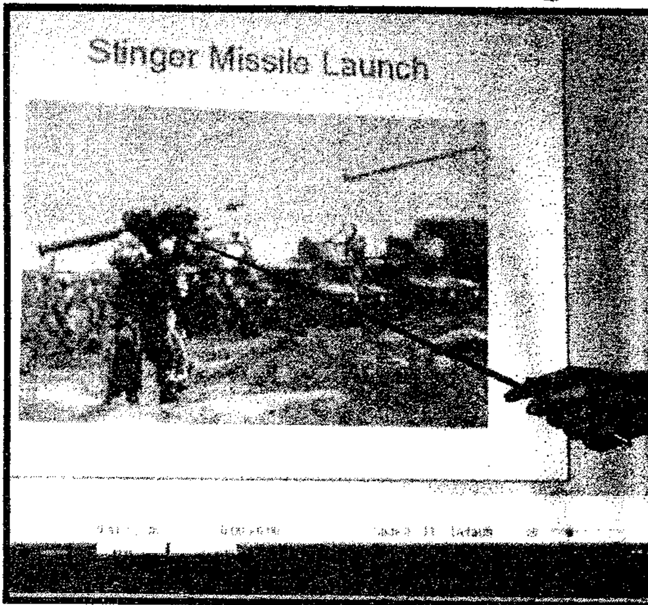
Stinger Missile Launch