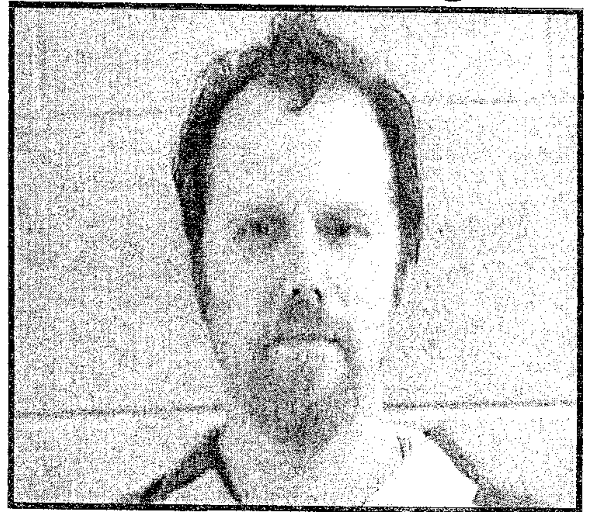
(see unlawful photos pg. 5)