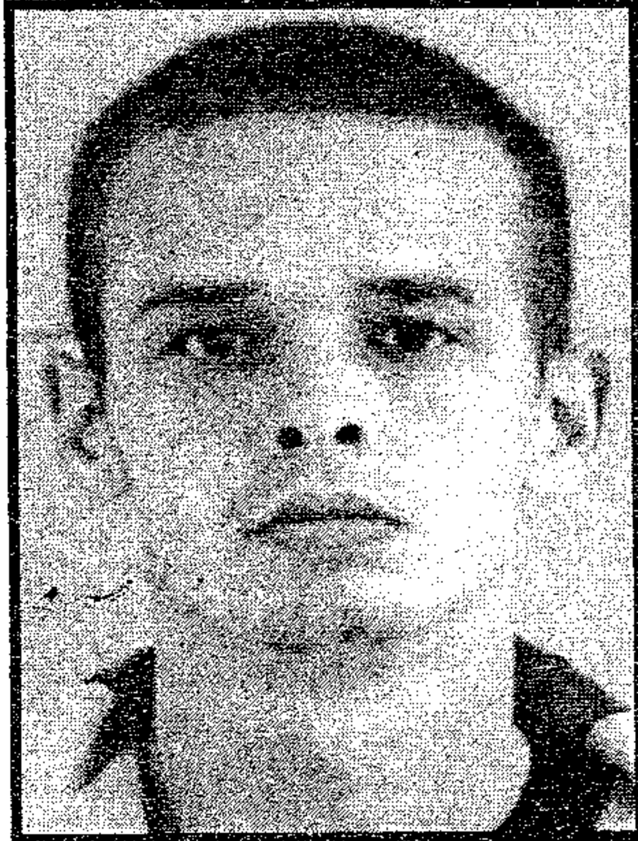
(see Maples pg. 7) Maples

One of three men accused of cutting copper wiring and copper pipes from a local residence was transported to the Loudon County Jail from the Monroe County Jail to face multiple charges Saturday. The other two are still incarcerated in Monroe County.