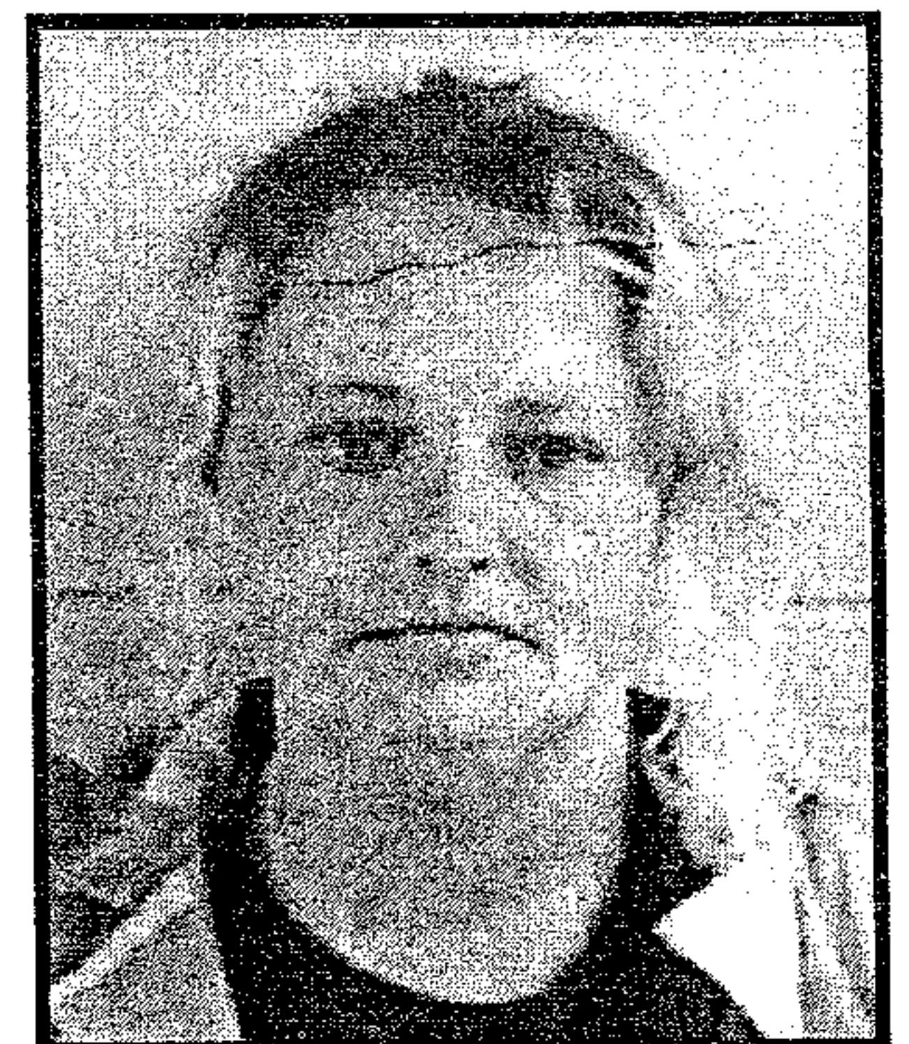
(see Shubert pg. 7) Shubert