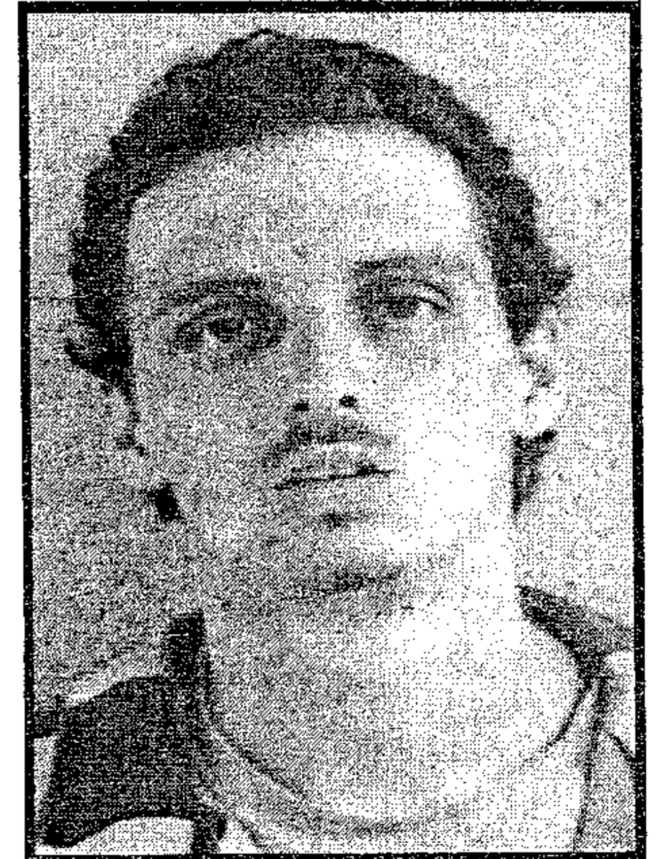
(see McGee pg. 4) McGee