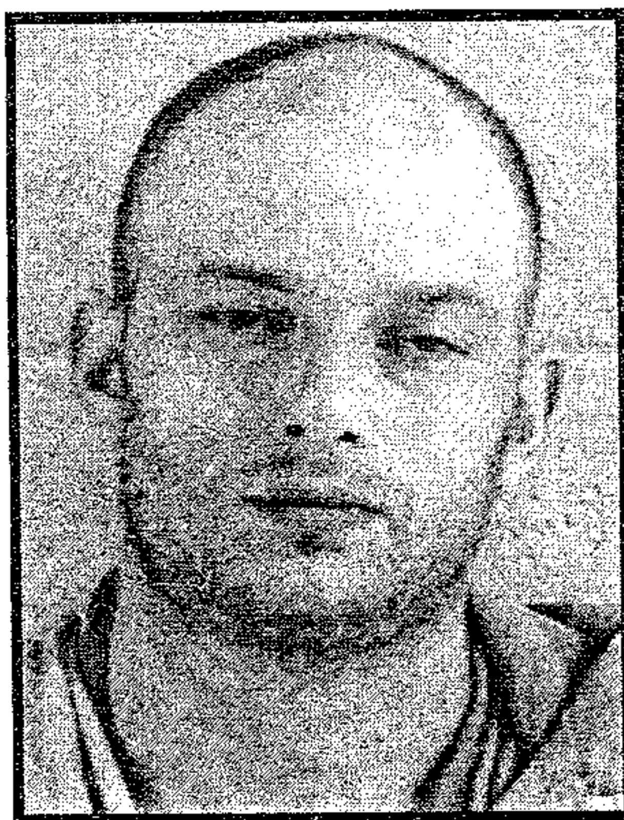
(see Carter pg. 3) Carter