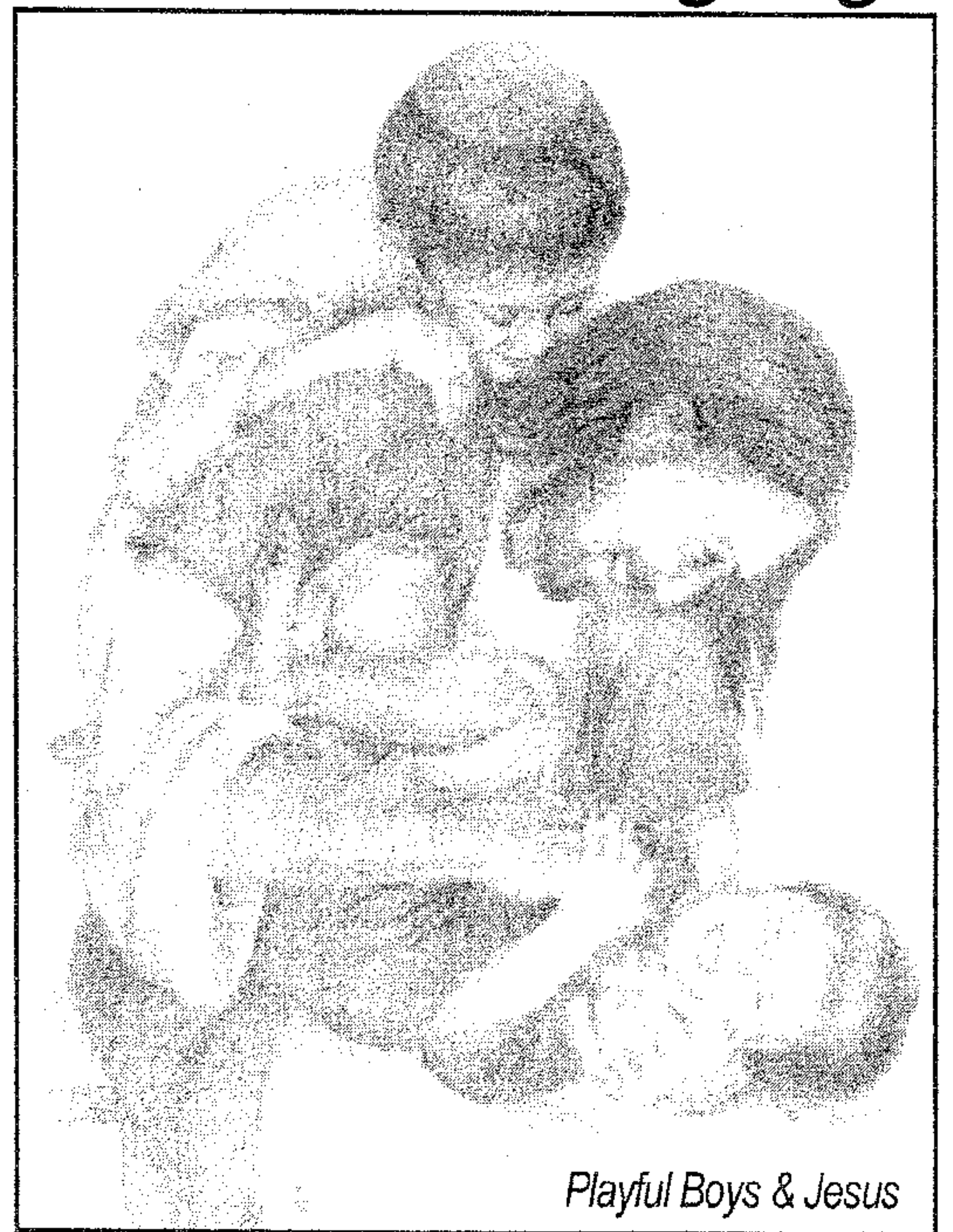
Playful Boys & Jesus