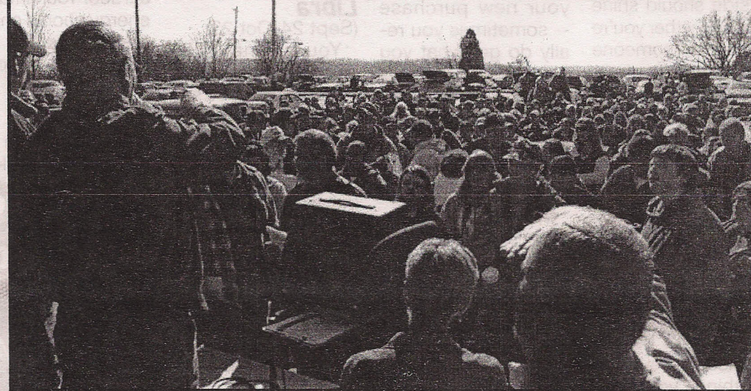
An estimated 500 people turned out to bid at the Sheriff's Auction held last Saturday at the Justice Center